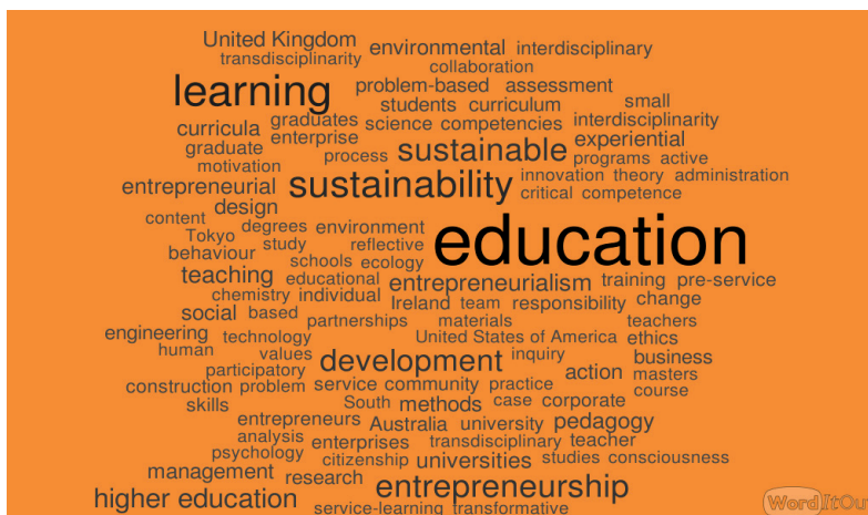
FIGURE 3 WORD CLOUD OF KEYWORDS

The 821 keywords of the articles were analysed by counting the most frequent ones, visualised as a word cloud (see Figure 3), and by clustering them into 15 categories (Table 4). This analysis confirms the searching strategy and selection process showing that most keywords address learning methods, (higher) education, sustainable development and entrepreneurship. The analysis further reveals that a broad range of other disciplines is involved in this research and learning field, that a diversity of learning aims is addressed and that many authors highlight the geographical (mostly national) context of their teaching and learning research.