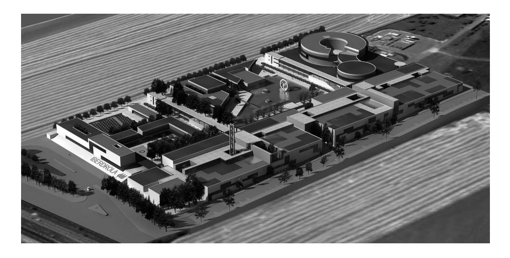
Figure 3. Project of the new «Educational & Sustainable Campus», Madrid (2007).

The Educational and Sustainable Campus, Madrid (Spain), 2007