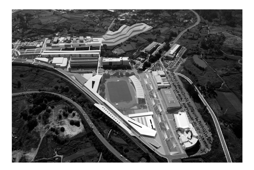
Figure 5. Project of the new «Educational Campus» (Elviña Campus - EHEA-Pavilions), University of A Coruña (2009).

was recipient of the Award «Campus of International Excellence» by the Spanish Ministry of Education, also falls into this research category.