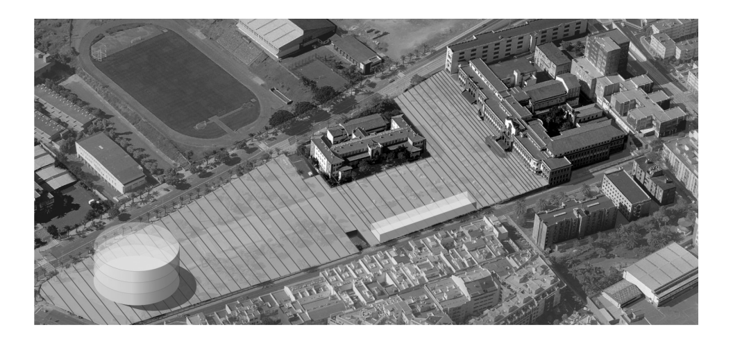
Figure 4. Project of the new «Educational Campus». (Learning & Research Resources Center), University of La Laguna (2009).

In 2009, the institution planned the requalification of its central space (adjacent to the Plaza Cruz de Hierro ). To achieve a sound transformation of this traditional location, the university decided to renovate the great open space, removing the current parking lots and redesigning it as a new pedestrian environment (enclosing a new botanical garden). In order to reinforce this urban nucleus, a new building will be erected: a Learning and Research Resources Center. The outcome of such a modern transformation will be the birth of a big urban and academic agora , that will exemplify the close union between university and city.