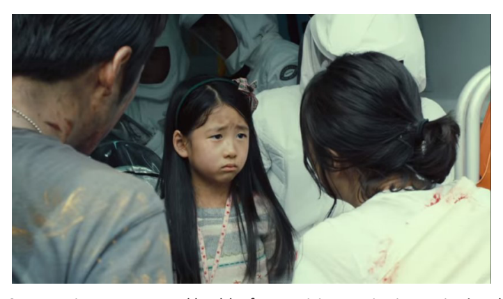
Photo 10. Person in apparent good health after receiving passive immunization therapy.