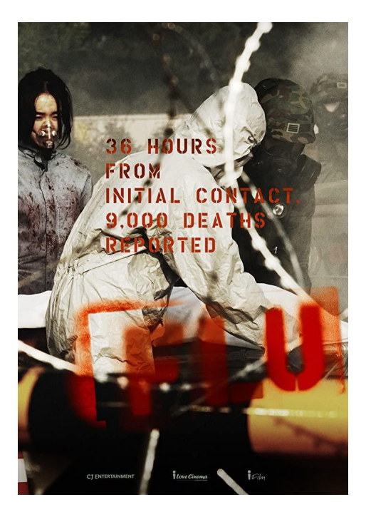
Action: Seoul (Korea). Current era. American poster.