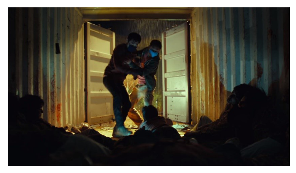
Photo 1. Beginning of the epidemic, where a container full of corpses victims of a deadly virus and a survivor are observed.