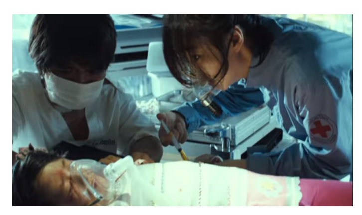
Photo 9. Administration of donor blood plasma to an infected person.