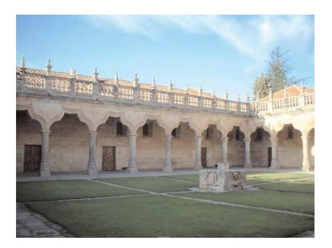
Number 4. : University of Salamanca: Patio de Escuelas Menores (fifteenth century).