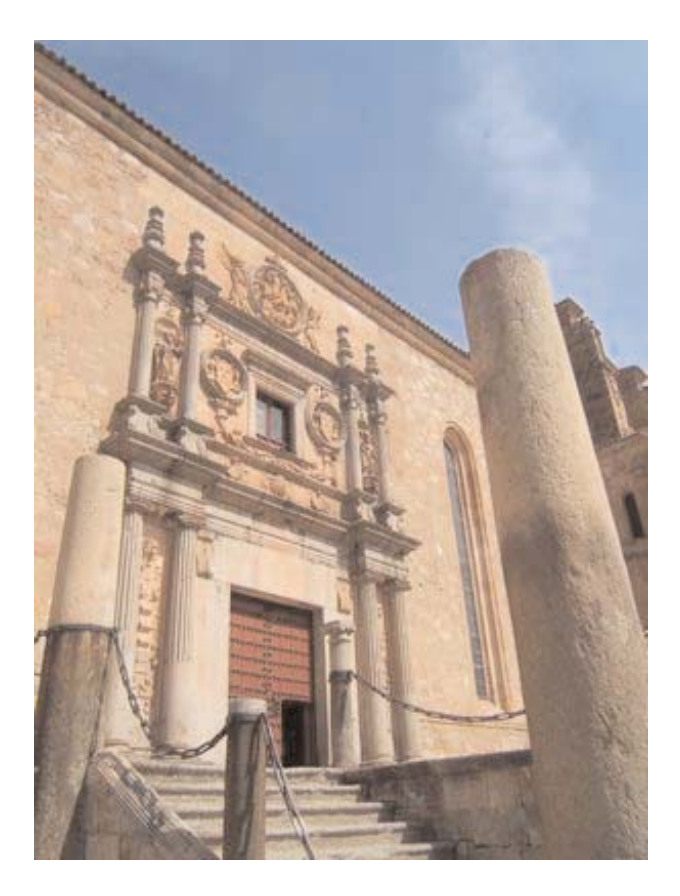
Number 2. University of Salamanca: façade of the Mayor Arzobispo Fonseca palace (sixteenth century), currently a residence hall for visiting professors.