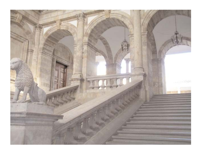
Number 3. University of Salamanca: Palace of the Anaya Family (eighteenth century). Stairway to the first floor.