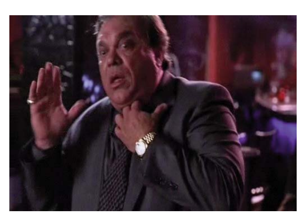
Figure 10: Signs of choking in Miss Congeniality

Black Knight (2001), by Gil Junger. This is a fantastical adventure comedy, undoubtedly a tribute to A Connecticut Yankee in King Arthur's Court. Jamal "Sky" Walter (Martin Lawrence) works dejectedly in a mediaeval theme park -Medieval World-, which, to his frustration is threatened by the construction of a similar park close-by. After falling into a disgusting moat of the park in an attempt to retrieve a medallion, he finds himself in 14<sup>th</sup> Century England (1328) in the kingdom of the usurper King Leo (Kevin Conway). He presents himself to the usurper as a messenger of the Duke of Normandy, who wishes to establish an alliance with Leo through his daughter. He meets Victoria (Marsha Thomanson), a young woman who is head of the opposition faction in the castle; that is, followers of the legitimate queen. In one of the amorous adventures within the Court, he is found "in fraganti" with the King's daughter. The King realises that not only has the upstart stained his honour and that of his daughter but also that this action will prevent the marriage with the Duke of Normandy. Just as he is about to be punished for his deeds, Jamal tries to