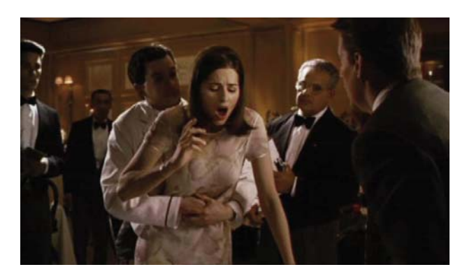
Figure 9: A Walter performs the manoeuvre on Molly in That Old Feeling

hostage and begins his flight, in which an agent is wounded (Figure 10).