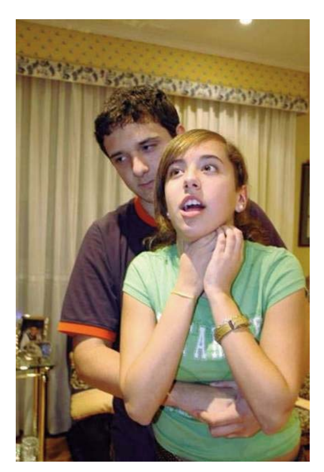
Figure 2: Correct position for performing the Heimlich manoeuvre

On other occasions the manoeuvre is done with the victim lying down, in the following way: