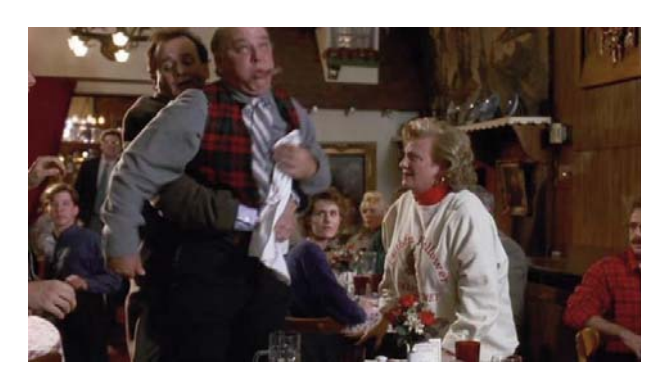
Figure 7: Expelling the foreign body in Groundhog Day

town. There, one of the diners is eating a steak. A large lump of meat causes an FBAO, which Phil solves majestically with the Heimlich manoeuvre (we know that since the fact was repeated over and over, he had learned it well and performed it with technical perfection) (Figure 7).