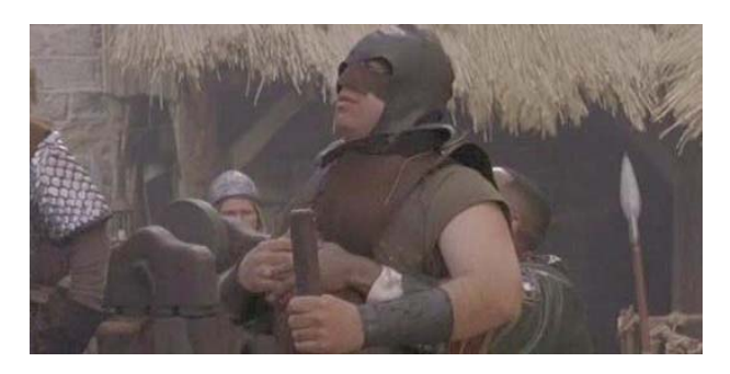
Figure 11: The Heimlich manoeuvre performed on the executioner in Black Knight

make the village believe that he is a sorcerer, and indeed he manages this because just as he is about to be executed, the executioner chokes on a piece of apple. This is the punishment, and the irony is that he rescues the executioner by performing the Heimlich manoeuvre, albeit clumsily. The village people understand that both the problem and its resolution have been caused by enchantment (Figure 11).