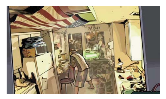
Figure 20: The back of a chair can be sufficient to perform a Heimlich manoeuvre in A Scanner Darkly

Victory Blizzard (2007), by Greg Carlson, is a short movie that includes the Heimlich manoeuvre in its four-minute duration.