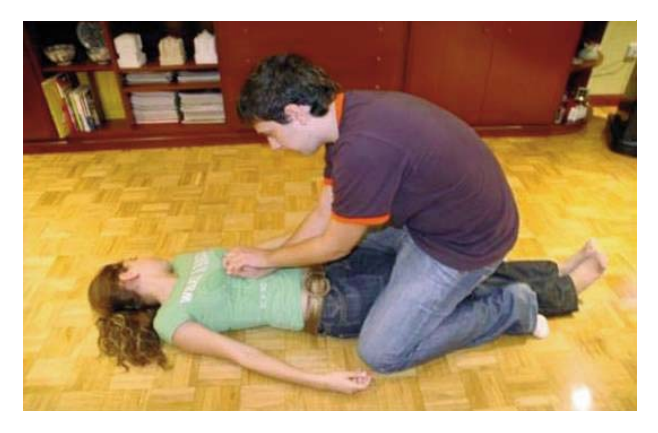
Figure 3: Heimlich manoeuvre with the patient lying down