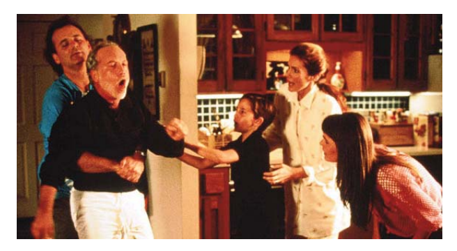
Figure 6: The patient saves his psychiatrist in What About Bob?

town. There, one of the diners is eating a steak. A large lump of meat causes an FBAO, which Phil solves majestically with the Heimlich manoeuvre (we know that since the fact was repeated over and over, he had learned it well and performed it with technical perfection) (Figure 7).