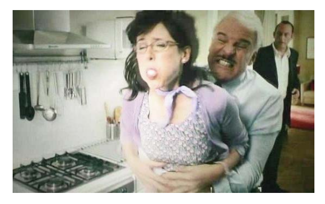
Figure 19: The unforgettable Inspector Clauseau in action

A Scanner Darkly (2006), by Richard Linklater. This is a rotoscoped film and is a cop thriller/SciFi combination. The plot is disturbing because it's possible. In order to protect people from drugs, the police keep tabs on them. The action takes place in Orange County in California. A man suffers an FBAO when he is eating; he tries to do the Heimlich manoeuvre on himself and eventually manages to do so with the back of a chair (Figure 20).