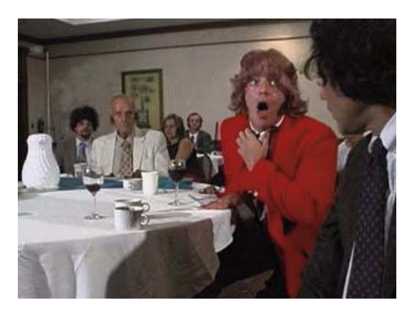
Figure 22: The choking person puts hand to throat in The History of Choking