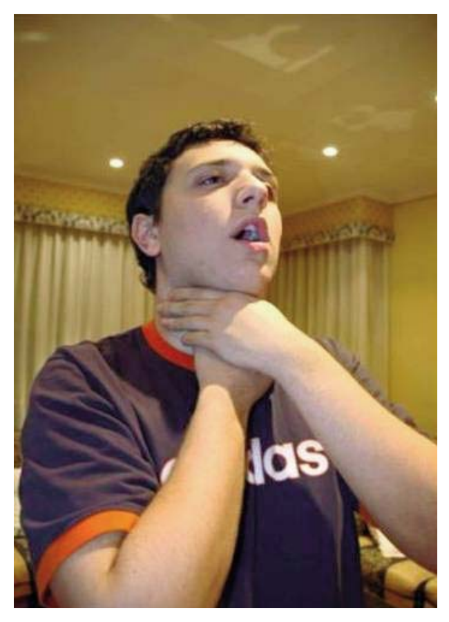
Figure 1: Universal sign of choking

the effectiveness of gentle thumps on the back has been demonstrated, as have rapid abdominal compressions (the Heimlich manoeuvre) and compressions with dry thrusts to the thorax (a variation on the Heimlich manoeuvre in which the resuscitator and his/her hands are in the same position but the hands are placed on the anterior plane of the thorax, in the centre). The chances of success increase when these methods are combined, although in order to simplify training, it is recommended to start with abdominal compressions and, if they prove to be ineffective, perform compressions with dry thrusts to the thorax. In the case of pregnant women or obese persons (where it impossible to encircle the abdomen) initially compressions with dry thrusts to the thorax should be implemented. When the victim loses consciousness, the resuscitator must immediately initiate CPR manoeuvres, and must check whether there is something blocking the victim's mouth (removing it is this were the case) each time the airway is opened<sup>1,5</sup>.