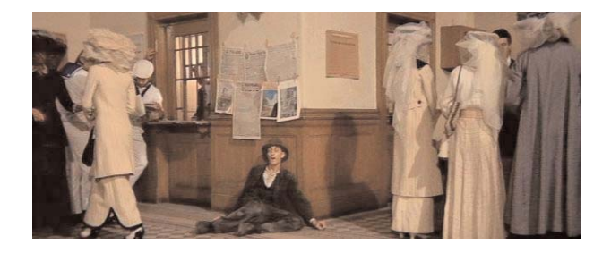
Figure 3: The man who collapses at the station

when he turns his gaze on Tadzio (figure 2), who seems to personify a spontaneous explosion of beauty at its finest. Von Aschenbach's condition as a consummate, exemplary, balanced and unambiguous artist collides openly with the pulses of passion awoken in him by the youth. Thus, for our character all physical contact would be polluting and would drag him to a fearsome hell. It would be impossible for him to remain in a scenario packed with "inadmissible" temptations. The return journey is by train and when it crosses the city we again hear the theme of the adagietto. By chance or cause, the trip is a failure and must be cancelled because we learn that his luggage was mistakenly sent to Como. Despite this irritating circumstance, the fact that von Aschenbach does not have to leave the city secretly pleases him immensely.