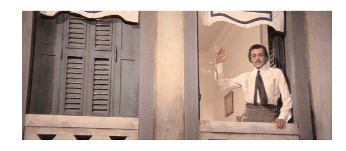
Figure 4: Tadzio's greeting

A very sick person collapses at the station (figure 3), but this has little effect on von Aschenbach because his return to the hotel takes priority over everything else.