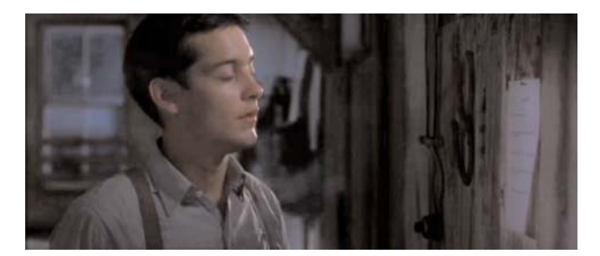
Figure 5. Homer reads the Rules that give the title to the movie

of the house there is a piece of paper that sets out the Rules (where the film gets its title from) (figure 5) that the seasonal workers reject because they do not consider them their own: they were drawn up by others.