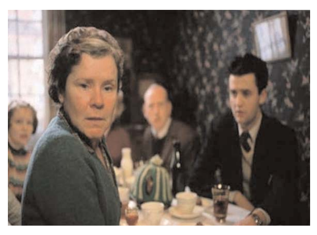
Figure 3: Vera Drake when the police are about to arrive. Second plane: her children and husband

asking for Mrs. Drake (minute 64). The entry of the police into the dining room involves a still shot in which Vera's expression is fixed in the field of view, where it remains in suspension. Thus begins the third part of the movie: the outcome (figure 3).