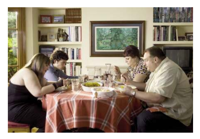
Figure 6: The obese family having lunch.

with him (he gives spoonfuls of cake to his wife), in an act full of apparent affection. However, he confesses that he does this to minimize the guilt he feels about his enormous appetite (Figure 6).