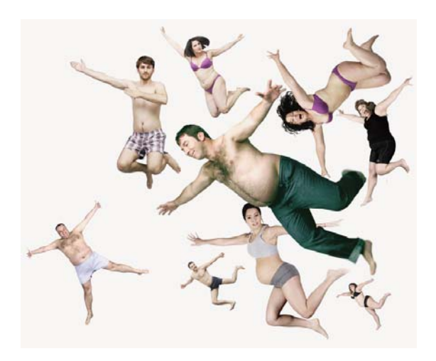
Figure 1: The main character of Gordos.

Although there is a discrepancy in the psychological determinants of obesity, all health professionals agree that overweight and obesity increase general morbidity and mortality. Obesity is a risk factor for some car-