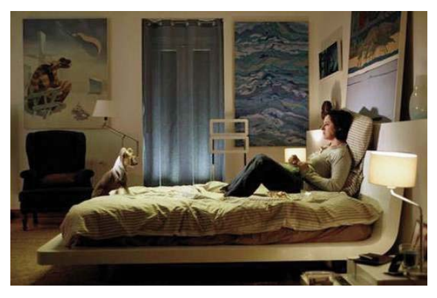
Figure 4: Leonor and its solitude.

Suddenly Leonor feels that she is no longer fat, but "light and wild". As a result, she goes to a bar, where she begins the first of a series of 20 relationships (equal to the number of kilos that she gained) with handsome and married men who will not commit to her. The series includes Abel.