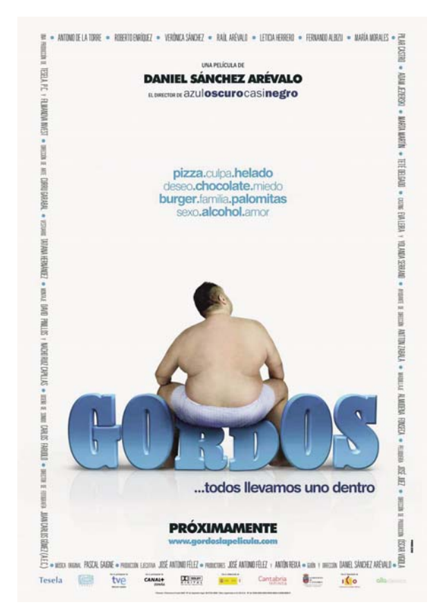
Spanish movie poster.