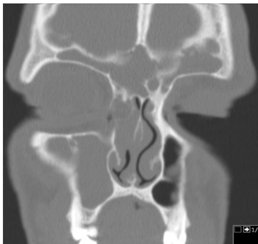
Figure 3. Coronal CT scan showing the occupation and destruction of the frontal sinus.

CT demonstrated an anterior table defect of the frontal sinus bilaterally and a left subgaleal abscess and right epidural empyema with focal meningitis. The CT also showed bony destruction of the frontal sinus, indicating osteomyelitis (Figure 3).