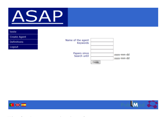
Fig. 3. Agent creation interface.

Each agent can be programmed thematically and functionally. The theme of interest is defined by specifying up to three keywords for each agent. The functional part is modeled by defining the date interval which matches the user interest. A snapshot of the interface used to create agents is presented in Fig. 3.