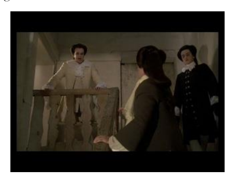
Don Giovanni, Joseph Losey. Finale act I

Losey captures the final scene with a clear narrative intention in the way angles are used, with the main character in a wide low angle, confronted to the citizens (as a group shot), who are shown from a high angle at the bottom of the stairs of the palace. These examples show that the choice of types of angles associated to narrative meanings alters the frontal depiction which is a characteristic of theaters and creates a dimension in 360 degrees through which the viewer can have a more intimate and subjective connection with the story. The use of this type of resources and associations makes it easier to carry out an audiovisual reading of works such as operatic films, which are constructed from preexisting musical material.