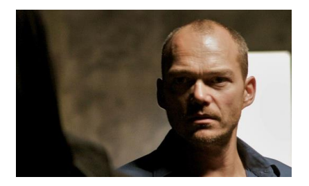
Figures 4 and 5: examples of depth of field and expansion of the narrative universe

would like to prevent it from happening, is larger than his own life. Both proposals, the external and grandiloquent approach by Joseph Losey and the more intimate and psychological portrayal by Kasper Holten, extend the narrative universe of the characters beyond the music and the libretto included in the original opera.