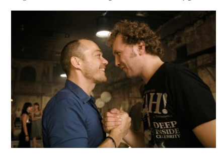
Figures 1 and 2: captures of the type of shots used at the end of act I in Juan and in Don Giovanni

ters. To do so, the author uses 200 shots in the final cut of the end of act I. This amount, together with a coherent combination of mid shots and slight camera movements, creates a more dynamic perception of the dramatic action than in the original scene by Losey (created with 55 shots).