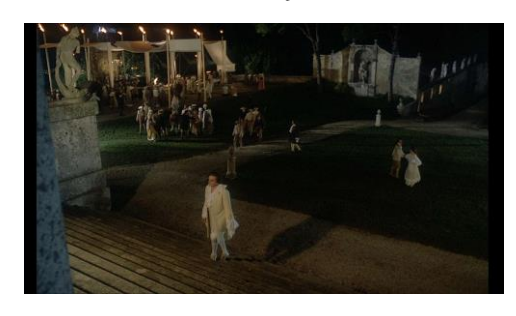
2. Don Giovanni, Joseph Losey (1979)

As we can see in figures 1 and 2, the audiovisual approach used in 1979 in Joseph Losey's Don Giovanni uses a classical language which is typical of historical cinema, in which the context of the narration gains special relevance (Gardner, 2004). Unlike Holten, Losey decided to narrate the scene with wide general shots that act as a spatial reference and which, in classical audiovisual language, have generally been accompanied by music with high harmonic density, a plurality of textures or an accelerated rhythm, as in the case of the finale of act I (Nieto, 2010; Citron, 2005, pp 204- 206). Based on that wide and grandiloquent approach and in line with the scenic design and the selected locations (the Italian buildings by Palladio in Venice and Veneto) the author uses group shots and mid shots to get gradually closer to the dramatic action (Gardner, 2004).