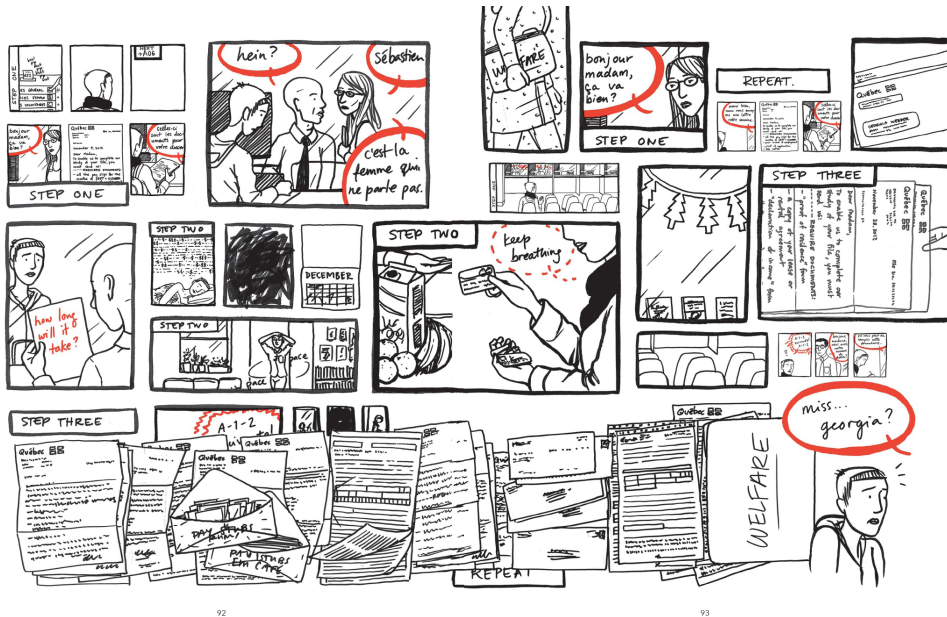
Fig. 2. Applying for disability welfare (Webber 92-93). From Dumb: Living Without a Voice , pp. 92-93. By Georgia Webber, Fantagraphics, 2018.

continually send her back and forth to gather and fill out more paperwork (Webber 92-93). As shown in the double-spread in Fig. 2, several panels depict Georgia contemplating the many forms that she needs to write, making mental monetary calculations, receiving and sending emails, and making phone calls. It is also worth noting that the repetition of the different steps of the process are scattered through the two pages, not following a clear, orderly reading pattern: sequences of panels itemizing one of the steps are depicted within bigger sequences detailing other steps, recreating for the reader the excruciating efforts that these unending processes of application demand, as Georgia repeatedly visits the welfare office. The many detailed documents and forms that the protagonist sends also hold visual importance, occupying the lower part of the double-spread and overlapping with other panels.