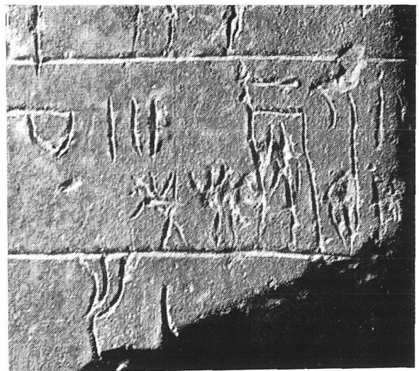
(c) Enlargement of part of line 4.