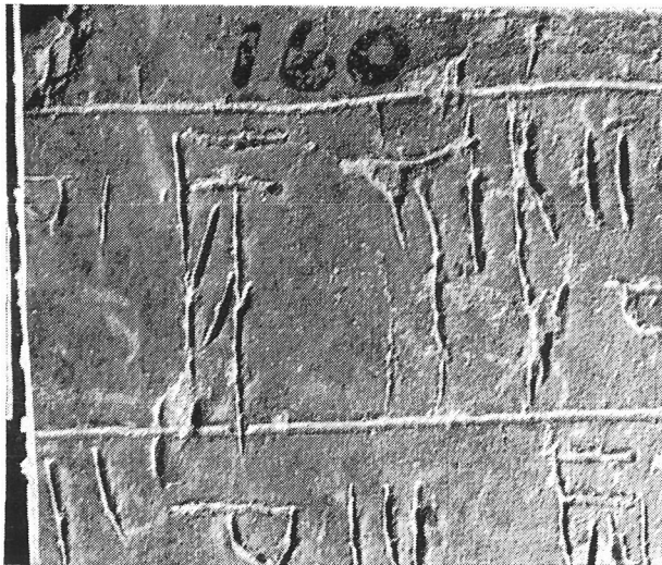
(b) Enlargement of part of line 3.