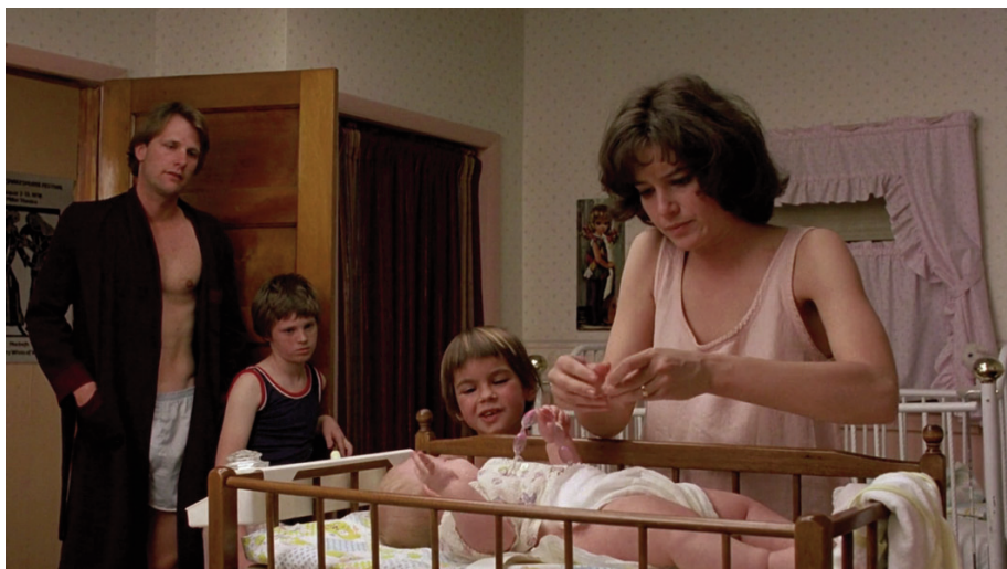
Croup is common in children.