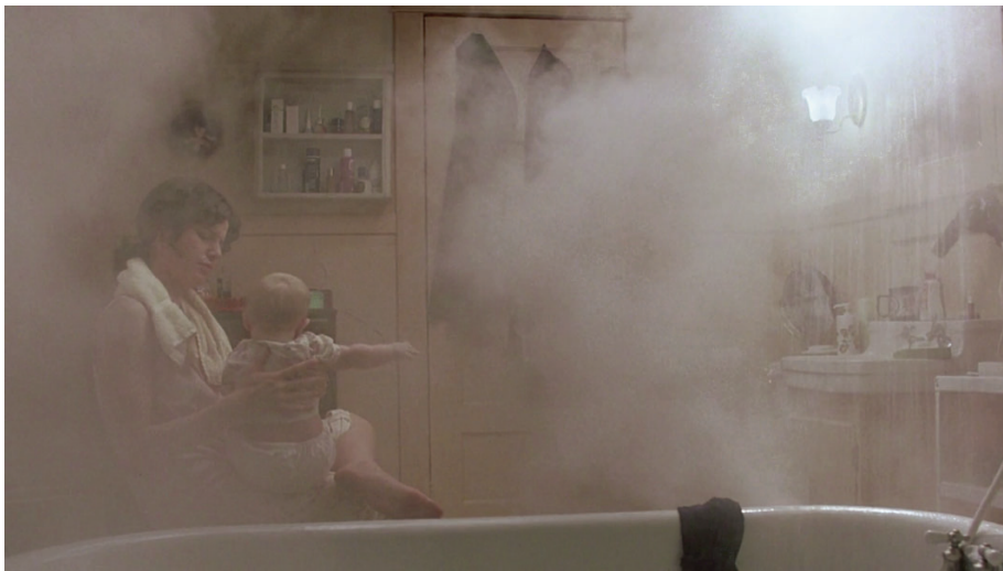
"God, that's the worst sound in the world" (barking cough).