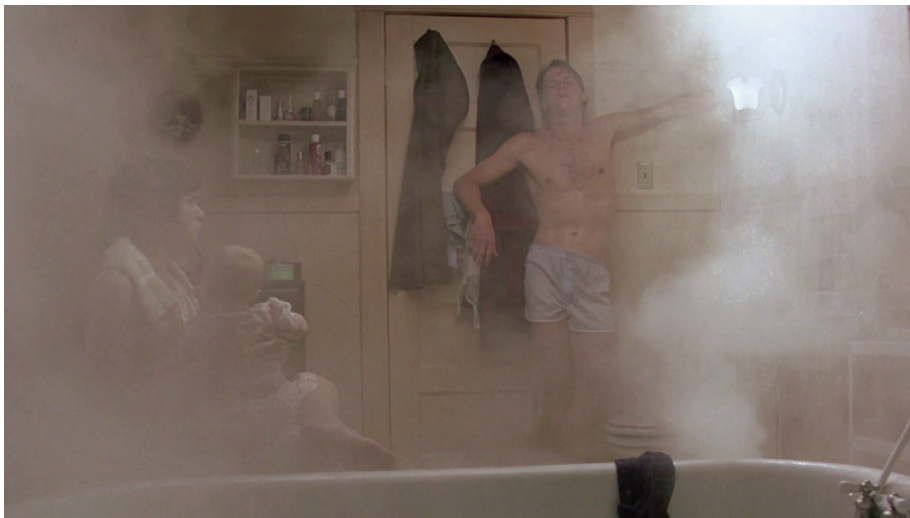
"How long do you keep her in here?"