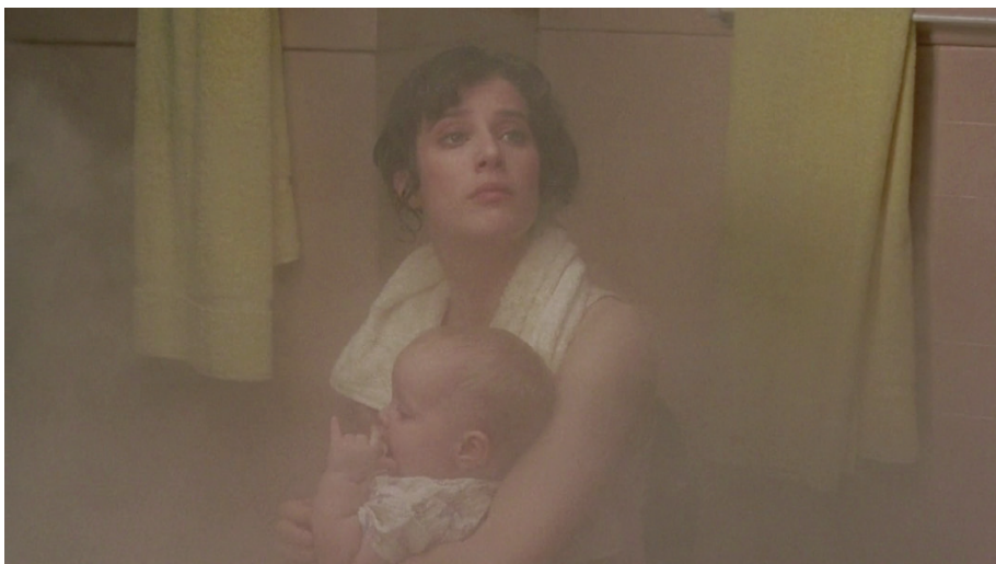
"Well, I don't know. Until her throat clears or I lose 20 pounds, whichever comes first,..., about 20 minutes, I guess".