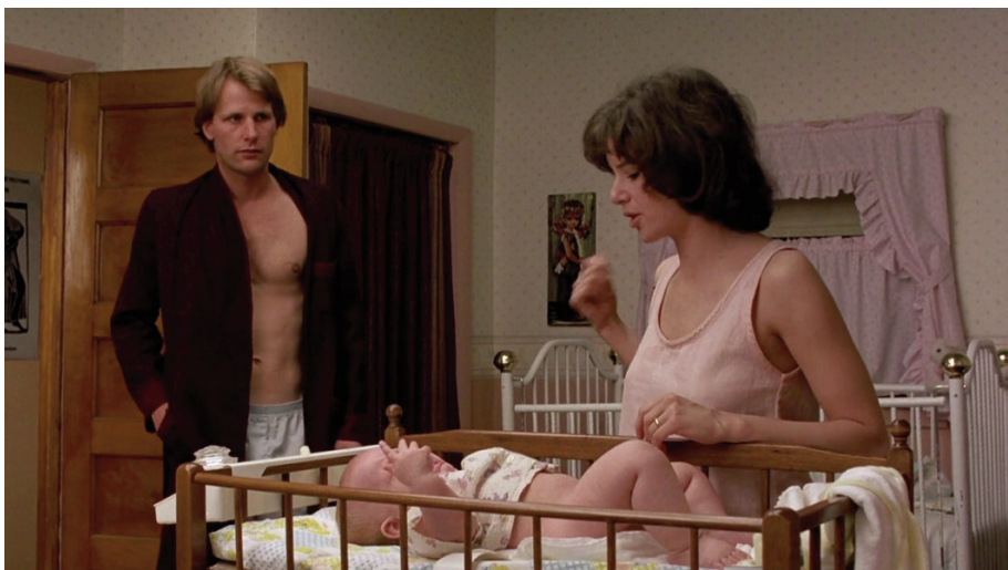
"I'm sure it's the croup. Remember, Tommy had it twice?"