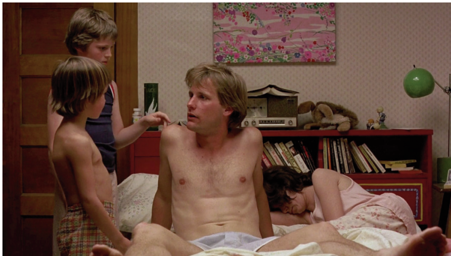
Often it starts at night. (“Dad. Come on, wake up, Dad, Melanie’s sick”).