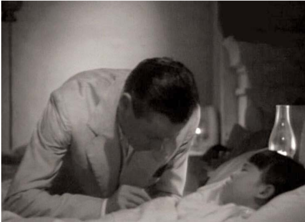
History of anti-cholera treatment: Injected caffeine