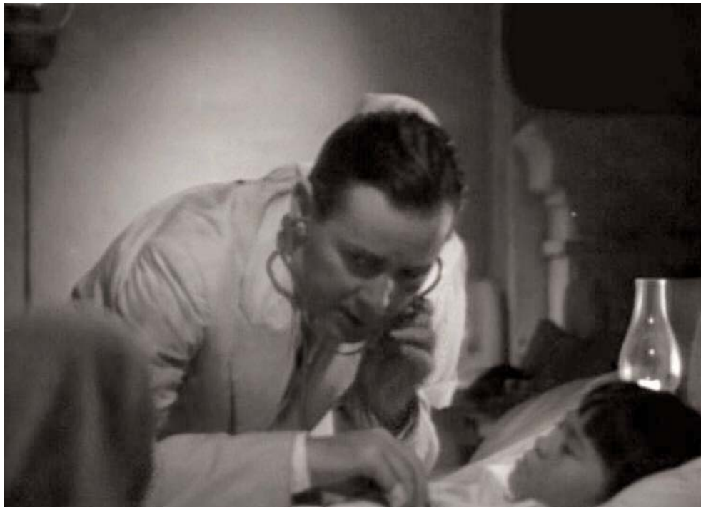
Clinical picture: Haemodynamic alterations

The action is set in China during the first quarter of the twentieth century. American poster USA poster