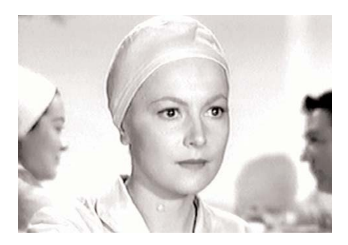
Figure 2: The feminine protagonist of film