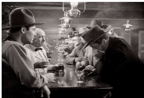
Figure 7: The cough of “Doc”

Coughing is the only manifestation of “Doc” Holliday’s pulmonary tuberculosis (figure 7). It is that the scene where he recites Hamlet could have been reflecting haemoptysis, for the handkerchief with