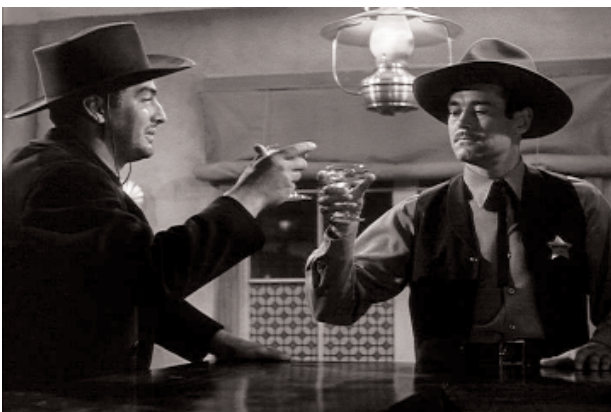
Figure 2: "Doc" Holliday and Wyatt Earp in their first encounter

Wyatt stands up from the table and goes to the other side of the bar where "Doc" is standing thus providing the opportunity for the first verbal contact between both characters (figure 2). Undoubtedly, they did not know each other but although both have mutual references about each other Wyatt's ideas about the gambler are not precisely the best. The meeting starts with champagne, continues with a confrontation, and finishes in a relaxed atmosphere with a generalized invitation by "Doc". When he tries the whisky he undergoes an intense attack of coughing, thereby demonstrating for the first time his very poor state of health.