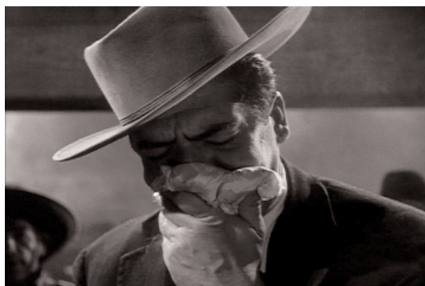
Figure 8: The hemoptysis of “Doc”?

which he covers his mouth appears bloodstained (figure 8). This phenomenon presents abruptly, either as attacks or as an isolated form, and according to the sound in the movie it might not have been productive. When it does appear “Doc” usually covers his mouth with a handkerchief. It is a manifest cough that leads the spectator to unconsciously become aware that the character is sick and that he is suffering from tuberculosis, although the name of the condition is never mentioned. It appears at key moments, such as the first meeting with Wyatt; when he is reciting Hamlet; when Clementine arrives, and right before he receives the deadly shot. On occasions, his coughing is triggered by the consumption of alcohol. Liquor is considered to be an aggravating factor of the illness. Mac (J. Farrell MacDonald), the bartender, says to “Doc”: “This is what is killing you” and even Wyatt indirectly suggests upon his arrival that he should abandon it, receiving a rough answer: “That is none of your business.” The dry reply was: “Just keep on doing like that and it will become your burier’s business”.