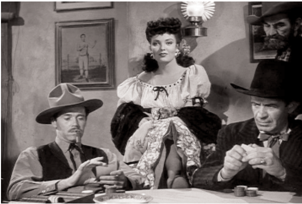
Figure 1: Chihuahua, "Doc"'s girlfriend

Wyatt stands up from the table and goes to the other side of the bar where "Doc" is standing thus providing the opportunity for the first verbal contact between both characters (figure 2). Undoubtedly, they did not know each other but although both have mutual references about each other Wyatt's ideas about the gambler are not precisely the best. The meeting starts with champagne, continues with a confrontation, and finishes in a relaxed atmosphere with a generalized invitation by "Doc". When he tries the whisky he undergoes an intense attack of coughing, thereby demonstrating for the first time his very poor state of health.