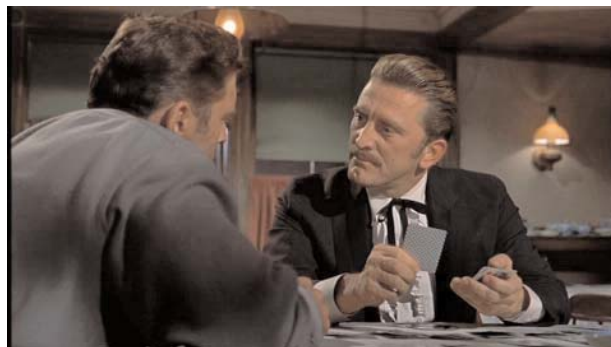
Figure 10: "Doc" Holliday and Wyatt Earp in their first meeting

The second narrative segment takes place in Dodge City and has three purposes: to further explore the relationship between both main characters; to present Wyatt's falling in love, and to show the breaking-up of the relation between Kate and "Doc".