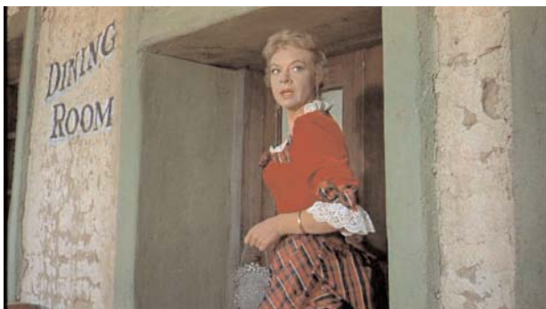
Figure 9: Kate, "Doc"'s girlfriend

The second narrative segment takes place in Dodge City and has three purposes: to further explore the relationship between both main characters; to present Wyatt's falling in love, and to show the breaking-up of the relation between Kate and "Doc".