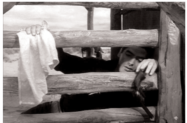
Figure 6: The death of “Doc”

Virgil wounds Billy and when he arrives at the Clanton’s ranch after the chase he finds him already dead. As Virgil leaves the house, the patriarch kills him with a shot in the back. Chihuahua’s surgery was successful, but while “Doc” was finishing the operation, the Clanton arrive back in Tombstone. They throw Virgil’s body down and tell Wyatt that they will be waiting for him at the OK Corral. “Doc” joins the Earp brothers because despite the initial success of the surgery, Chihuahua eventually dies. At dawn, they walk to the place where the duel is to take place. After the confrontation the only survivors are the two Earps and the oldest Clanton (figure 6). Wyatt spares his life and wishes that he may live 100 years so that he can suffer as much as his own father did. While leaving, however, the patriarch treacherously tries to kill him, obliging Morgan to shoot him dead. Though very much in love, Earp and Clementine break up. He is to go to see his father and she is to stay in Tombstone as a teacher. They say farewell to each other with a chaste kiss of Wyatt’s to her cheek and we are left with the possibility of his returning some day an unknown. All ends as it began, with the impressive images of Monument Valley.