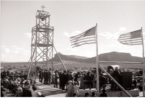
Figure 4: The values that John Ford defended

they were eating together, “Doc” arrives; however, since he notices that Clementine has not yet left the city, he abandons the city with anger as an assistant to the driver of the Tucson stagecoach (Arizona).