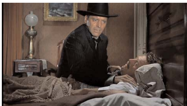
Figure 14: "Doc" general poor state of health

What are "Doc's" manifestations of the tuberculosis. The condition mainly manifests itself in his cough (figure 12). His coughing cannot only be seen but the characters repeatedly refer to it, with nuances to the effect that his cough is something special. "Doc's" coughing is at first isolated and dry but as the action develops it becomes worse; it increases in frequency as well as in intensity and duration. Thus, while in Tombstone to interrogate Kate about the murder of Wyatt's brother, he undergoes a new bout of coughing that almost makes him faint and gives him dyspnoea (figure 13). The attack is of such intensity that his former girlfriend even suspects that he might be dead (figure 14). His coughing even appears in the middle of