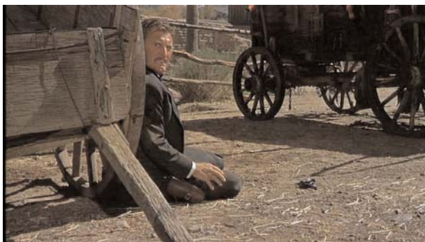
Figure 11: "Doc" in the duel at the OK Corral

The Earp family has become a problem to Ike and his followers, especially after Wyatt's posting as a federal marshal. Ike and his band, in the presence of Kate, make plans to eliminate him while he is on his last night patrol. That night, however, Jimmy asks Wyatt if he might substitute him and is mistakenly taken and murdered in his place.