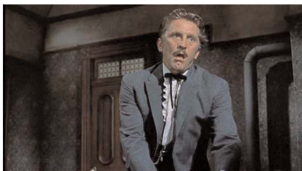
Figure 13: Succession of cough attacks followed by dyspnoea

No mention can be found about Doc's suffering from tuberculosis pulmonale, but the images speak for themselves. Since Kirk Douglas' constitutional type was slightly asthenic, his aspect fits fairly well with the classical image of a person suffering from tuberculosis. When he played the role he was forty-one; ten years older than "Doc" at the time of the duel.