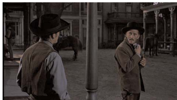
Figure 15: Cough with a sensation of fever

What are "Doc's" manifestations of the tuberculosis. The condition mainly manifests itself in his cough (figure 12). His coughing cannot only be seen but the characters repeatedly refer to it, with nuances to the effect that his cough is something special. "Doc's" coughing is at first isolated and dry but as the action develops it becomes worse; it increases in frequency as well as in intensity and duration. Thus, while in Tombstone to interrogate Kate about the murder of Wyatt's brother, he undergoes a new bout of coughing that almost makes him faint and gives him dyspnoea (figure 13). The attack is of such intensity that his former girlfriend even suspects that he might be dead (figure 14). His coughing even appears in the middle of