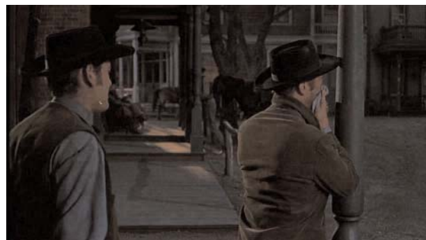
Figure 12: "Doc's cough"

"Doc" recommends Wyatt to remain within the law and that he should not convert the conflict into something personal, leaving later in order to interrogate Katy. She acknowledges that Ike and his followers have planned the murder in her presence and when "Doc" tries to attack her; he undergoes a further decline in his health. The youngest of the Clantons himself tells Wyatt that his brothers together with the McLowry brothers and Ringo will be waiting for him on the following day at the OK Corral for a duel to the death. Wyatt goes to see "Doc" to ask him if he is prepared to join the Earp brothers, but he finds sick and drunk, and Kate asks whether he cannot see that "Doc" is dying. Despite Kate's objections, the following morning Wyatt, Virgil and Morgan Earp, and "Doc", walk to the OK Corral. Upon their arrival a shoot-out takes place between the two groups; all their enemies die in the confrontation, and his brothers and "Doc" are wounded (figure 11).