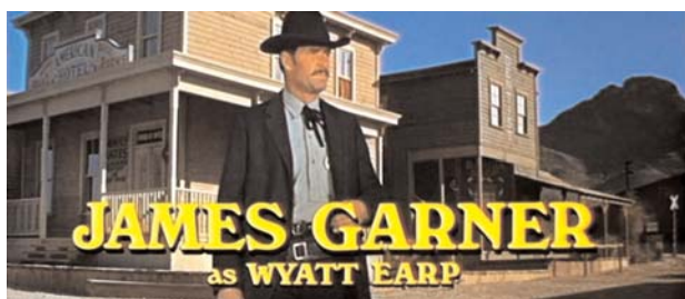
Figure 1: Wyatt Earp

The city is about to hold municipal elections for city Marshal, and Virgil, who is running again, has