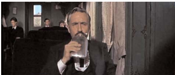
Figure 4: "Doc" and alcohol

We know he is a good gambler. He says he is good and does not need to cheat. In his last appearance in the film he beats his nurse. We also know that he has always lived slightly outside the law: "Just educating myself, Wyatt." He tells Wyatt that he has never actually lived inside the law and that he'd like to see what such a life might be like. Nevertheless, he has better ethics than the Marshal and he realises that Wyatt is motivated more by a sense of revenge than justice. He tells Wyatt he should stay on the right side of the law and this indeed is his last wish for him.