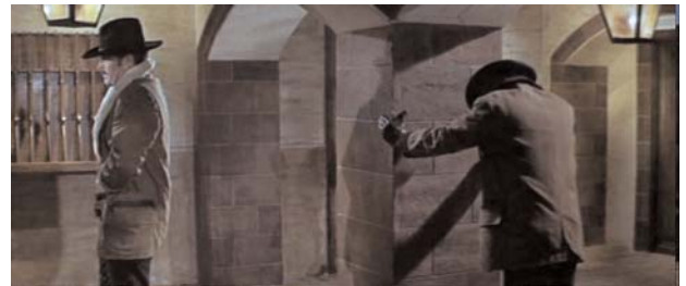
Figure 5: Doc's cough

when he is unable to beat Ike's three gunslingers and has to ask for Wyatt's help. On the other hand, in this film "Doc" does not smoke. Actually, none of the characters smokes and when "Doc" coughs he does not cover his mouth. Unlike other films, too, he does not frequent saloons.