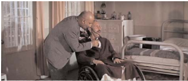
Figure 8: The Doctor attend to “Doc”

He never coughs up blood. The worsening and deterioration become so intense that “Doc” ends up in the Sanitorium at Glenwood Springs (Colorado), taken there by Earp (figure 7). Here, “Doc” can enjoy a sunny, cold and dry environment, fresh food and rest (he goes around in a wheel chair, covered with blankets). In one scene the physician checks up on his health (figure 8) and a conversation develops between them: