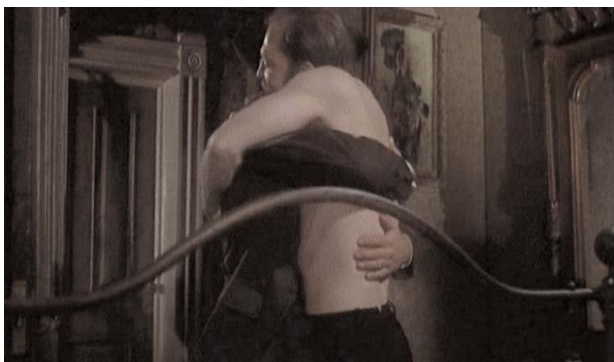
Figure 11: “Doc” meets Wyatt

After a bout of coughing in his room “Doc” goes down to the bar. At the bar counter thinks, while playing with the water left on the surface by glasses. Suddenly he gets up and goes after Kate, who is “working”. He picks her up and takes her to his hotel. The next morning, “Doc” gives Kate a beautiful white dress and takes her to a house he has rented for the two of them. On the way, Wyatt, who has been looking at one of his election posters, cannot help but show his anger at seeing “Doc” and Kate kiss. To “Doc”’s dismay, the house is like a pigsty.