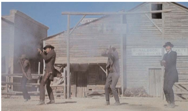
Figure 14: Gunfight at the OK Corral

The wind rattles the sign indicating the corral. The tension is seen in the men’s faces. Wyatt starts the fight (figure 14). Kid and “Doc” draw but the boy eventually holsters his pistol. “Doc”, however, shoots, killing the boy with a bullet to the heart. All Wyatt’s