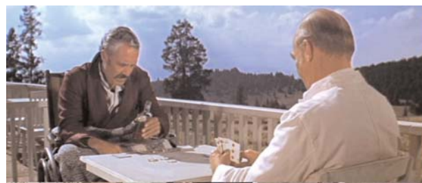
Figure 3: “Doc” at the Tuberculosis Sanatorium

In the long run, “Doc” plays poker with his nurse, drinks, coughs, recognises that alcohol is a poison and wins the game (figure 3).