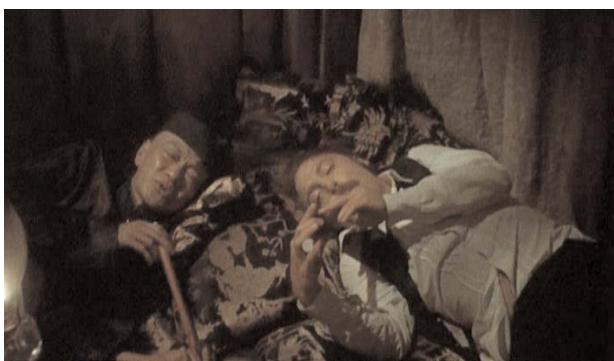
Figure 13: Doc" and opium

seeing how much “Doc” loves her. The girl finally finds him in the Chinaman’s house, smoking opium (figure 13). She reacts violently and sets fire to the Chinaman’s business. Ike and his group arrive, while Wyatt is designating Morgan and Virgil as deputies and they swear their oaths. Kid, who has been sent by Ike to the town, tells “Doc” -who is having breakfast, apparently with whiskey- about the problems Wyatt caused when he said that the deal was off, and that 7 men, including himself, are coming after him. He tells him this because he does not want the gambler to die.