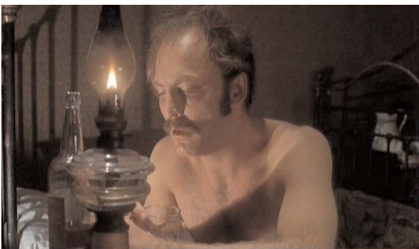
Figure 16: Coughing and dyspnoea