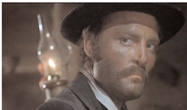
Figure 9: First appearance of “Doc”

At night, a rider struggles across the desert through a storm. He arrives at a saloon and the light reveals who he is. He is young, is dressed in black and his unshaven face sports a moustache and a sore on his nose (figure 9). In the bar are the owner, who is Mexican, two men and a woman, who is in the arms of one of them. The man manages to get a drink, even though it is only warm beer, and also wins the woman, a prostitute, in a card game with Ike Clanton, one of the men, who is accompanied by his nephew Kid. Since Ike is not willing to accept the result of the game, the man (“Doc”) draws his pistol and throws them out. He spends the night in a room at the bar with Katie (figure 10), and then he goes to Tombstone to see a friend and identifies himself as Doctor Holliday, “Doc” to his friends. The following day, accompanied by the woman, he faces the challenge of crossing the last part of the desert before arriving in the city. That night he tells Katie that he is not a physician but a dentist.