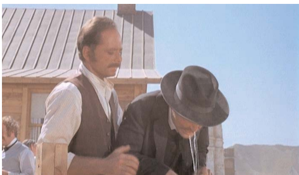
Figure 12: “Doc” has an intense bout of coughing and coughs up the whiskey he was drinking

After tending to him, “Doc” takes Wyatt home. Wyatt tells Virgil to make a deal with Ike: if he hands over Ringo he can keep the reward. He thinks that this way he can become sheriff. “Doc” goes home