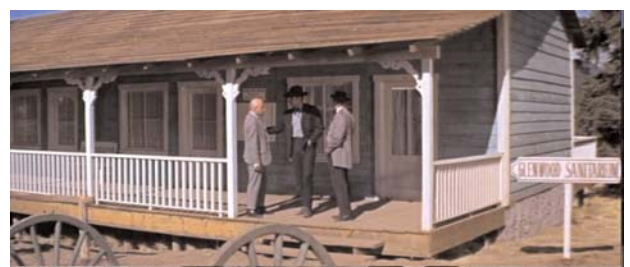
Figure 7: The Glenwood Sanatorium