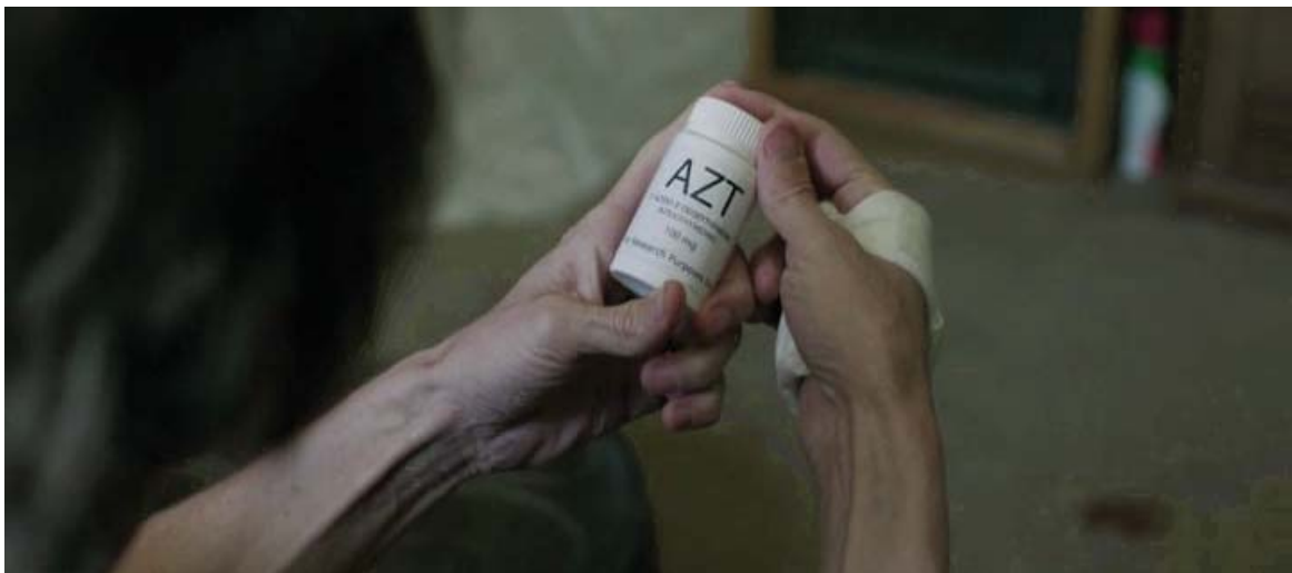
Rayon initially takes AZT,...