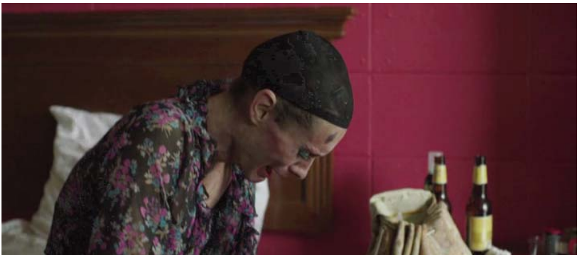
... Rayon shows Kaposi's sarcoma on his forehead.