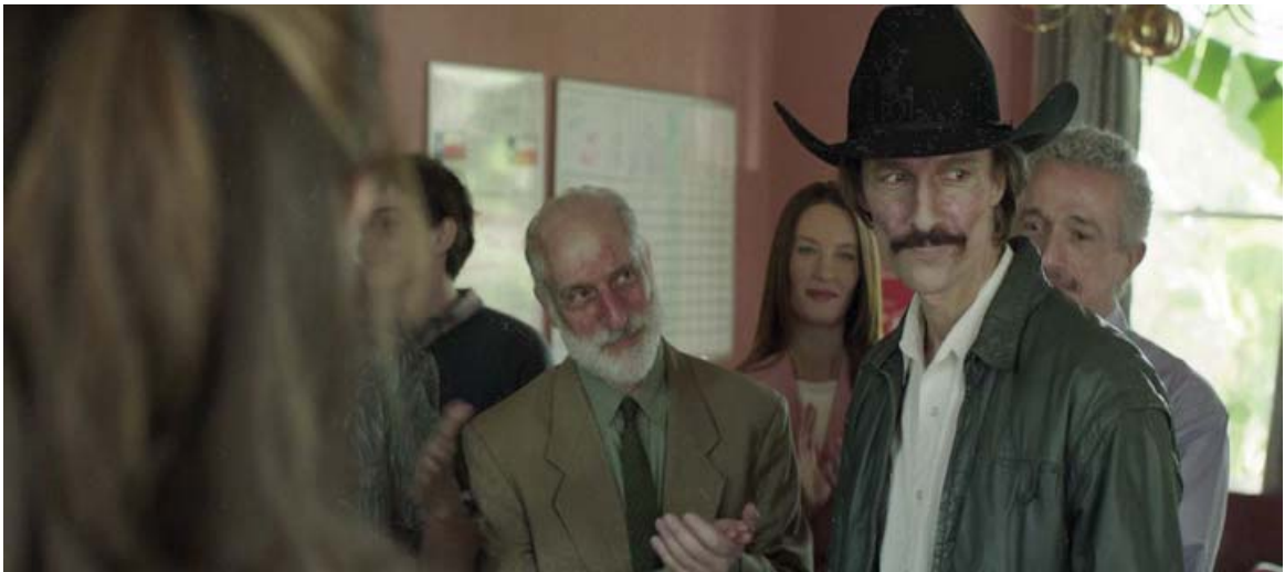
... Seborrheic dermatitis,...