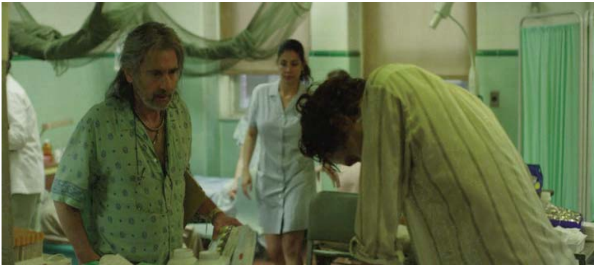
... Moments of great impairment,...