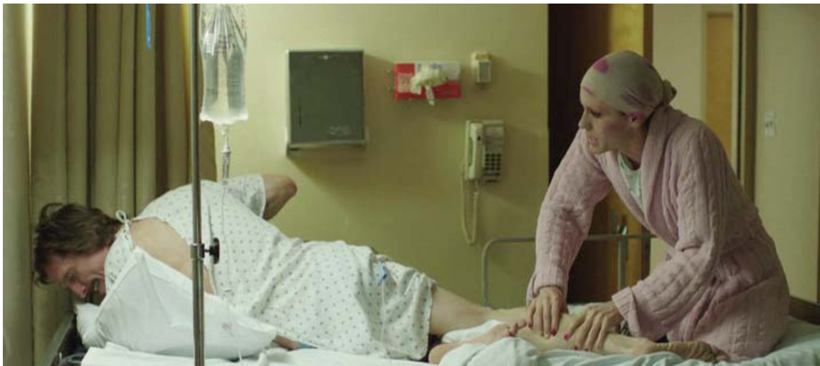
... Muscle cramps in his calf,...