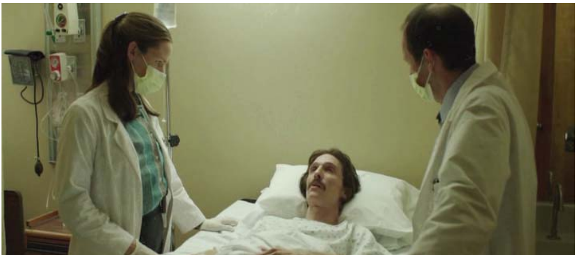
... Hospital admissions,...