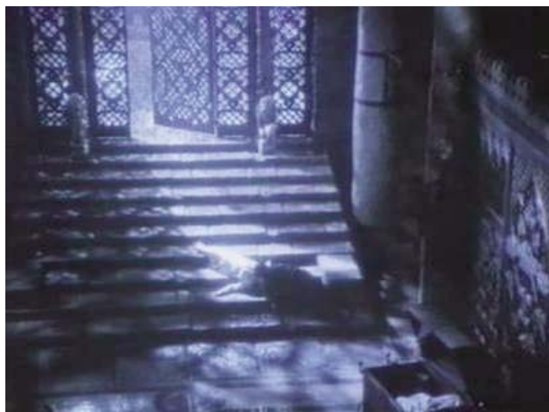
Figure 7: Final scene with the dead lovers

The coda written by Verdi for the finale is replaced by a postlude based on the music that has previously accompanied Otello's entrance to the nuptial enclosure. In a lugubrious and distressing setting, the camera silently contemplates the dead lovers, where Desdemona to a certain extent recalls the Nazarene on his cross (Figure 7). The fruits of evil in the purest state; execrable,... painful,... Pure evil.