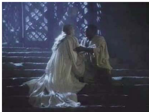
Figure 3: Love duet between Otello and Desdemona

ed by Cassio's designation as captain of the navy. The plot moves to the scene of the wedding celebrations, which contains the ballet music that Verdi wrote for the third Act of the production offered in Paris. While the celebrations are ongoing Iago makes a toast, requesting Cassio to join in, and never stops pouring the wine. When Roderigo laughs at his drunkenness, Cassio attacks him. When Montano tries to break up the fight Cassio threatens to crack open his head and they start to duel. Iago asks Roderigo to sound the bells in alarm to attract Otello's attention. When asked by the Moor, Iago tells him that the fight was begun by Cassio and Otello dismisses the latter from office. After this episode, Otello goes to the bed chambers; he goes downstairs, as we shall see so often, perhaps in anticipation of his imminent fall. There, trapped by the bindings of love they sing of their joy, flecked with references to the history and events of Venice from the first Act of the theatrical production (Figure 3).