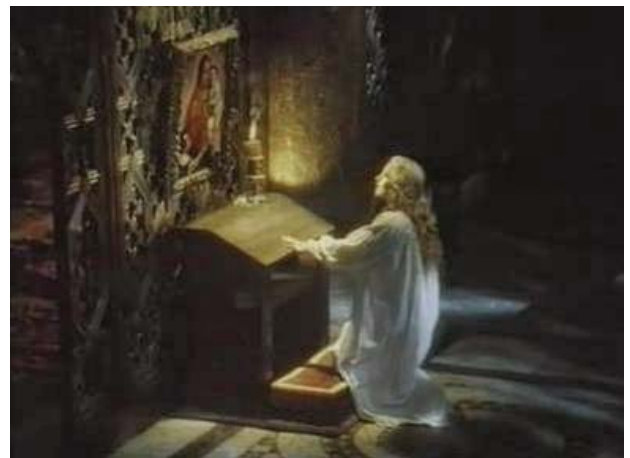
Figure 6: Desdemona in her prayer to the Virgin (Act IV)

At the beginning of the last Act, the director offers us a sort of ritual through which Otello reneges his faith and throws the holy cross into the flames. Desdemona is prisoner to anxiety and menacing premonitions. According to Zeffirelli, the passage dealing with the song about the willow would have delayed the action so he decided to omit it, but not the prayer to the Virgin because he wanted to underline Desdemona's religious convictions (Figure 6). Otello arrives and asks her whether she has asked for God's pardon for her sins. Of course her only sin has been to love him and she wants to prove her innocence. Otello tells her that nothing can save her now; the captain (Cassio) must surely be dead. Desdemona pleads for mercy but she is caught and strangled by Otello. We hear Emilia calling at the door to inform that Cassio has murdered Roderigo. Horrified, she looks at