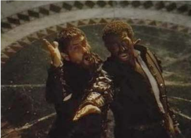
Figure 4: Duet between Iago and Otello (end of Act II)

The rogue tells him that Cassio talks in his sleep, and hints that they might be having an affair. He also says that the Captain holds a piece of evidence of his love: Desdemona's handkerchief. Otello is beside himself and both swear to avenge themselves before the crucified Jesus where Iago had previously pronounced his creed (Figure 4).