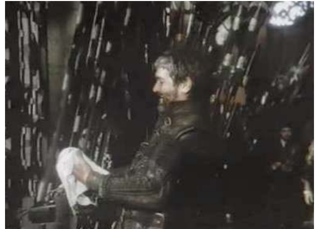
Figure 5: Iago with the handkerchief that Otello had given to Desdemona (Act III)