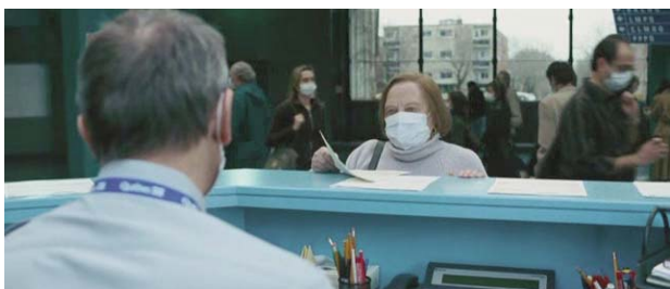
Figure 11: The Office of Citizen Defence of the Government of Québec

Leblanc works as a civil servant at the “Citizens’ Rights Dept.”, of the Québec government (Figure 11), an “Orwellian” state institution invaded by political correctness. In the building where he works there is a true persecution of smokers by the security staff. The defence of what is “politically correct” is illustrated in an incident, the one caused by Jean Marc when he tells his Afro-American colleague that he “works like a nigger”, because of which sanctioning proceedings are started against him. The film represents in a very clear way the public administration system that inevitably seems to hamper the citizens’ demands in a department that is supposed to “help” them. These Québec offices are provisionally located in the football stadium. They are a labyrinth of corridors and offices managed by the security guard. In them, civil servant Leblanc demands an endless stream of documents from the uncomplaining taxpayers who seek social benefits for personal problems.