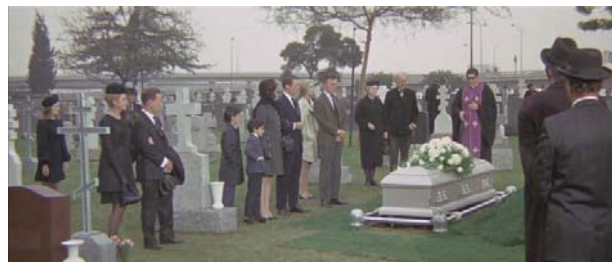
Figure 5.- In the last scene all the characters are gathered at the burial of Eddie's father

Eddie's symptoms are framed within adapta-