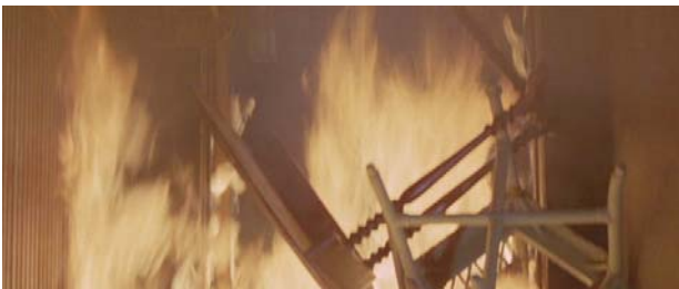
Figure 10: Eddie burns his parents’ house

The act of burning the chalet is a symbol representing a “break” with the past and a “rebirth” starting from scratch. This symbolic element is also used in The Arrangement when Eddie takes refuge in his parents’ house and burns the business documents belonging to his father’s ruinous rug company, and the fire later spreads to destroy the paternal house where Eddie spent the first years of his life (Figure 10). This rite involves the destruction of a lifestyle he no longer desires; an act of rebellion against a father who did not allow him to develop his artistic interests as a writer. It is a way of breaking with the past.