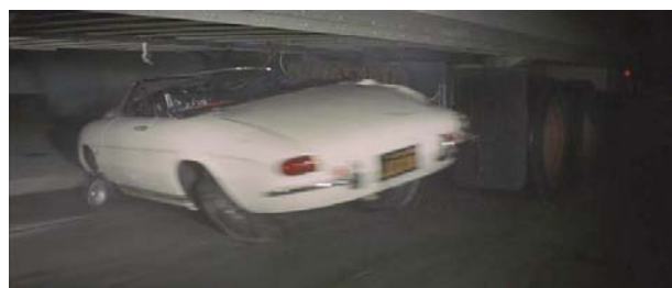
Figure 2: The main character tries to commit suicide by crashing into a lorry