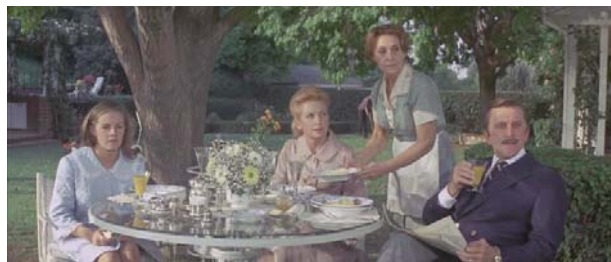
Figure 1: Eddie Anderson has an impressive house, a pretty and attractive wife, and an exemplary daughter

The Arrangement tells the story of Eddie Anderson (Kirk Douglas), a middle-aged advertising executive from Los Angeles of Greek origin (his real name is Evangelos Arness). He enjoys all the wealth and comforts that would make anyone happy: a successful job and a considerable income. He has finished an advertising campaign for a tobacco company, he has an impressive house in a residential area on the outskirts of Los Angeles, perfectly fitted out and with servants, several cars -among them a convertible sports car-, a pretty and attractive wife, Florence (Deborah Kerr), and an exemplary daughter who has finished high school and is about to begin at university (Figure 1). He even has an affair with a secretary... Everything seems perfect, but in his mind set he feels there is something that does not fit in: a deep underlying disillusionment brought about by the fast pace of his life, and a weariness with the way he lives. One seemingly ordinary morning after having breakfast in the garden of his mansion, while on his way to the office in his convertible and faced with the insistent repetition on the radio of the advertisement he himself has made for the "Zephyr" tobacco company, he has a nervous breakdown and attempts to commit suicide by crashing into a lorry (Figure 2). He survives, slightly hurt and apparently suffering from speech loss.