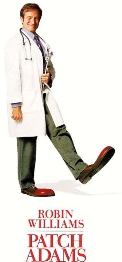
Figure 1: Patch Adams (Robin Williams). The prototype physician who uses humour in medicine

possibilities of gaining his degree, even though he is a privileged student. Walcott even sets up a tribunal to analyse Patch’s “excessive happiness”.