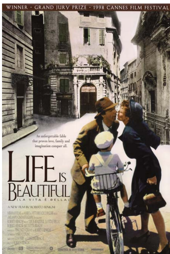
Figure 4: The subtle humour of Life is beautiful in the poster promoting it

their families and the medical staff's own experience. Some authors have suggested that the initiative for its use should be sparked by the patients themselves, although others consider that the medical staff should directly observe and attempt to identify the attitudes of patients as regards humour and laughter, asking them whether they like laughing and what makes them laugh. Our success in stimulating patients' laughter will be increased if we first ask ourselves the following questions 12 :