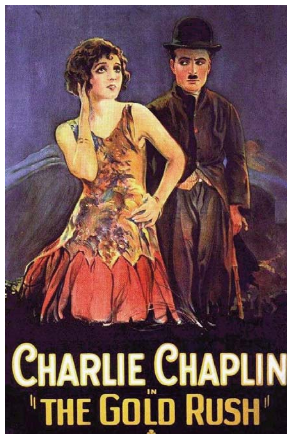
Figure 5.- A good film for smiling

The Gold Rush (1925) and The Great Dictator (1940) by Charles Chaplin, and It's a Mad Mad Mad Mad World (1963) by Stanley Kramer (Figure 5).