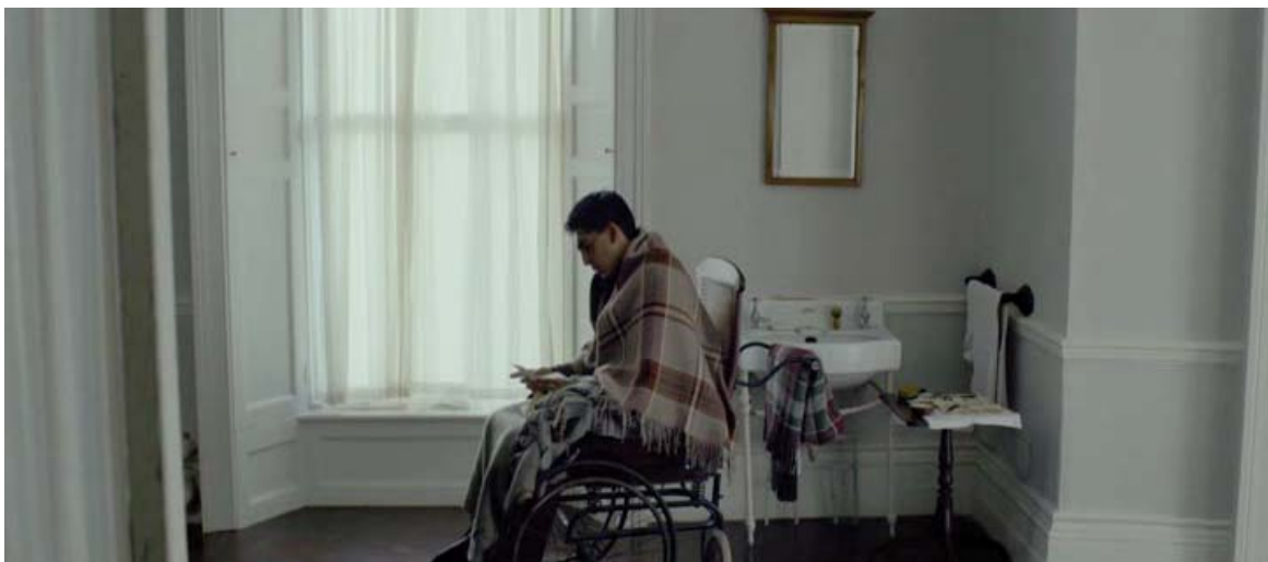
Placement in a sanatorium.