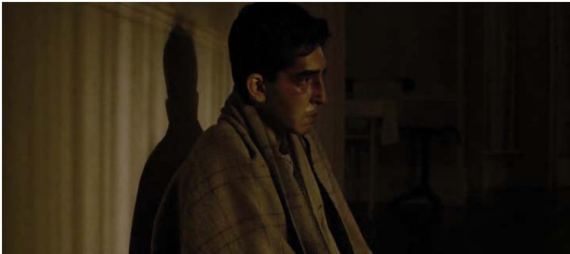
Poor general conditions and weight loss.