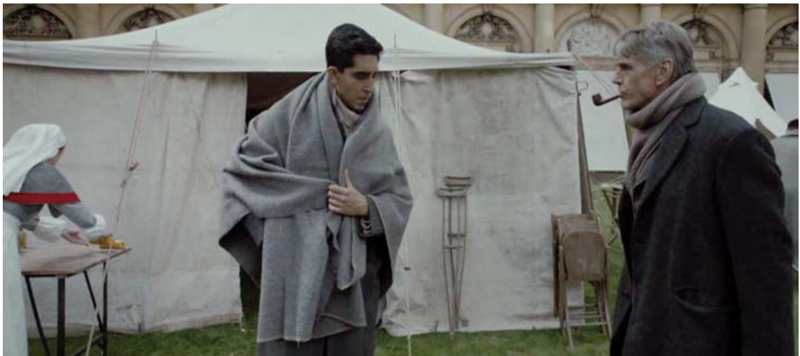
Malaise. (- Hardy "You're not well?").