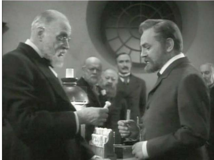
He tells Koch that he can develop a good way of staining his bacillus and Koch provides him with a culture.