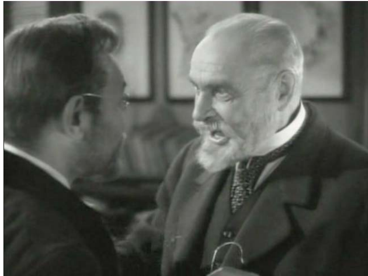
He shows his discovery to Koch, who in his excitement offers him a job.