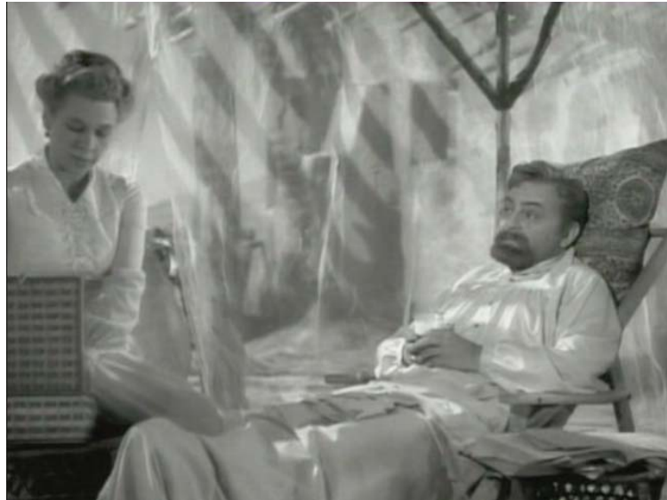
Ehrlich and his wife travel to Egypt so that he can recover from tuberculosis with the help of the climate, rest and healthy eating habits.