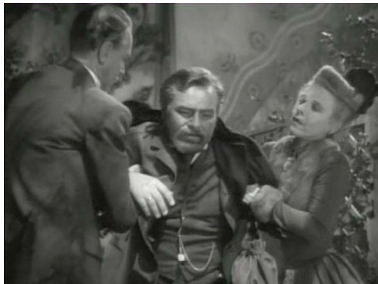
During the celebration, while dancing with his wife he faints. He suffers from pulmonary tuberculosis caused by his work with the bacillus.