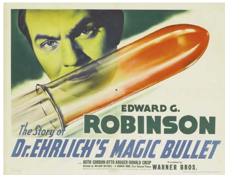
The film does not include Ehrlich's work with tuberculin, entrusted to him by Koch, but it does include his discovery of the magic bullet.