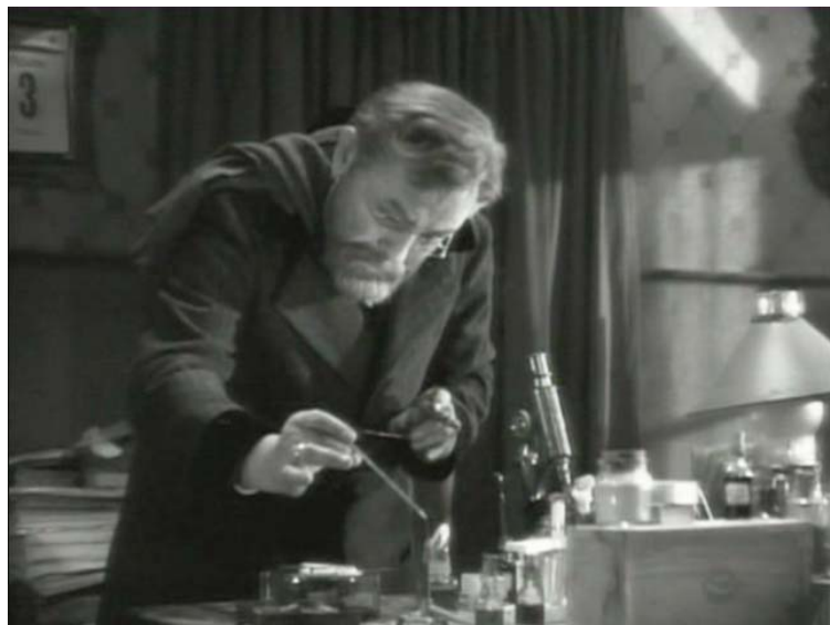
Some time later, at home, coughing and freezing with the cold he attempts to stain the bacillus.