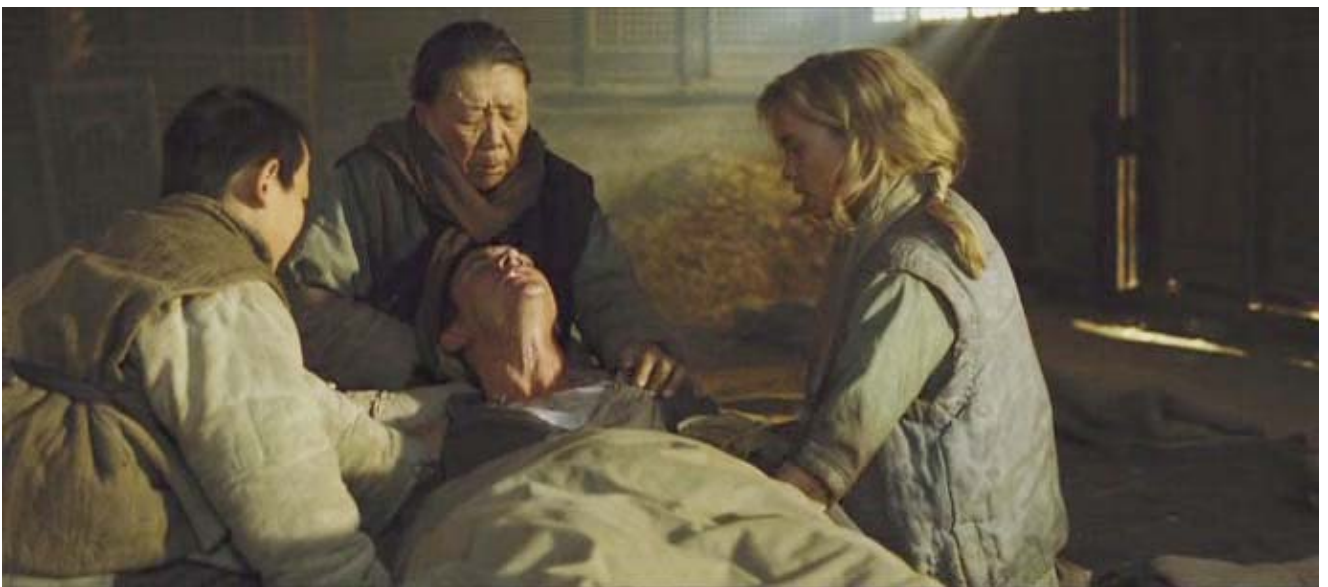
...generalized muscular spasms.