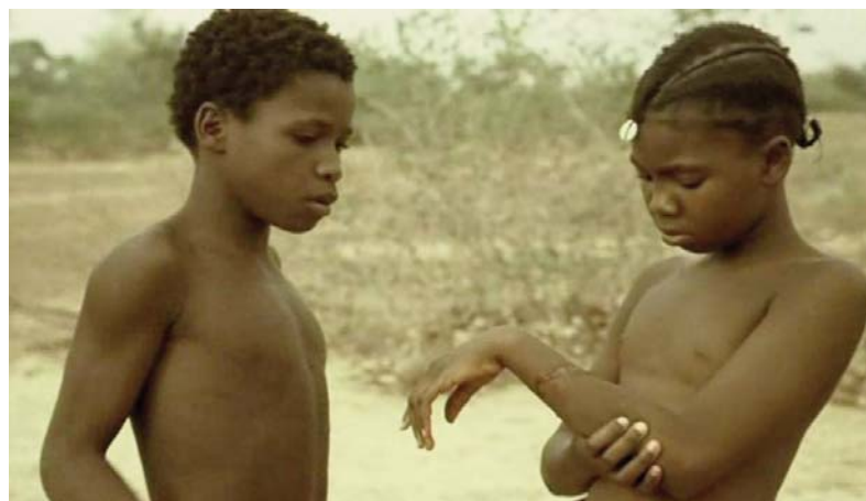
Traumatic inoculation through a wound produced during a knife-fight.