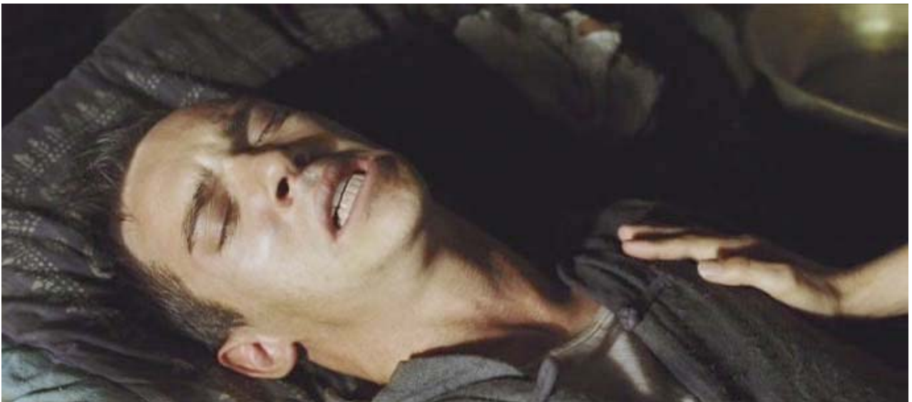
...trismus, or lock-jaw,