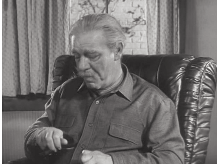
Primarily affects proximal interphalangeal and metacarpophalangeal joints. Bilateral.