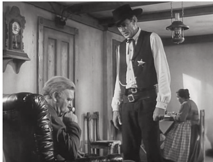
...suffers from rheumatoid arthritis...