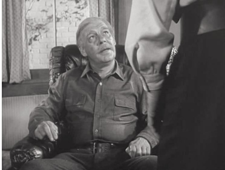
...chronic inflammatory disease that affects multiple joints.