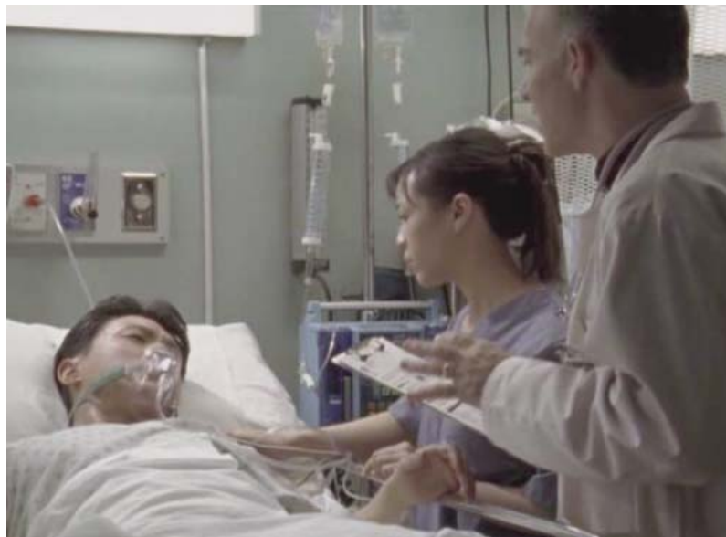
Treatment: Supportive measures.