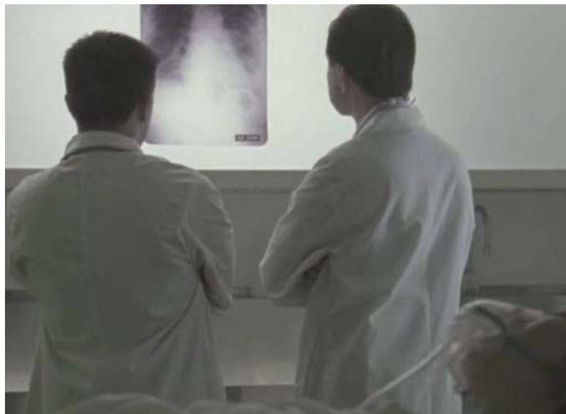
Most people with SARS develop a serious pneumonia.