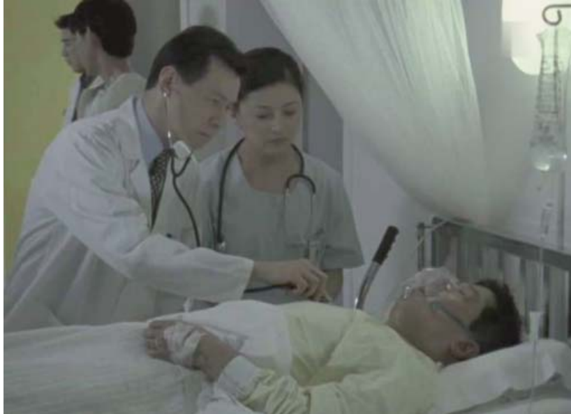
Symptoms: Respiratory distress.