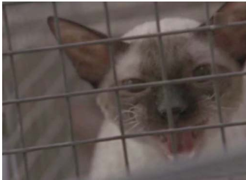
Epidemiology: Reservoir in nature: Chinese small mammals (civet cat).