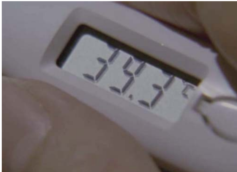
Symptoms: High fever.