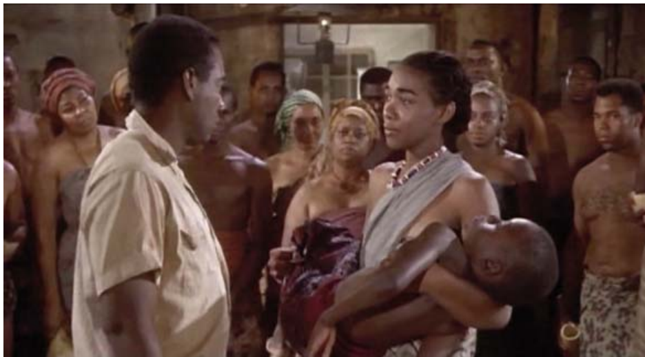
Sleeping sickness: Coma (“¿Can madame wakes my son from sleep that never ends?”).