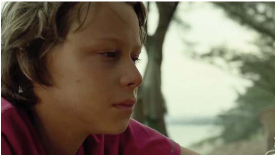
Bad general condition.