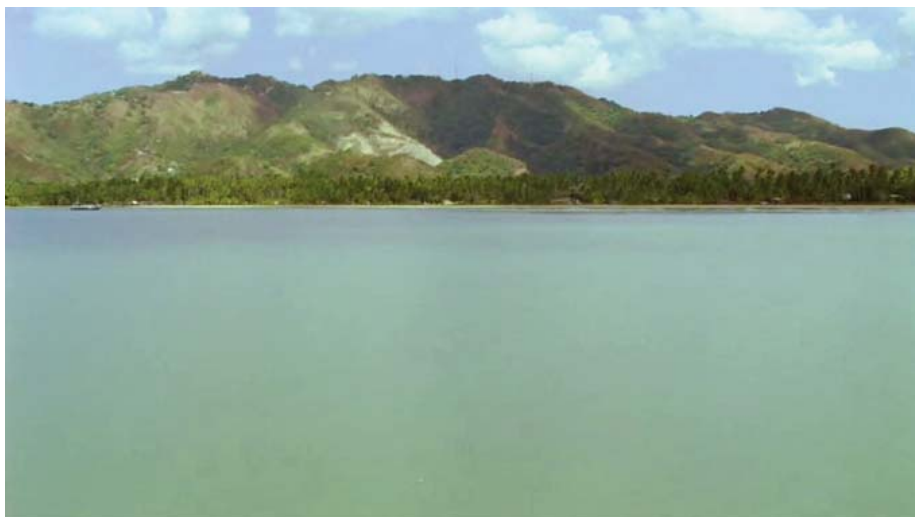
Mozambique, area of Plasmodium falciparum distribution.