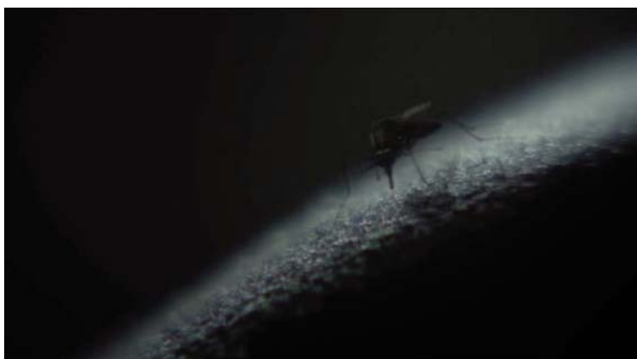
Vector: Anopheles spp.