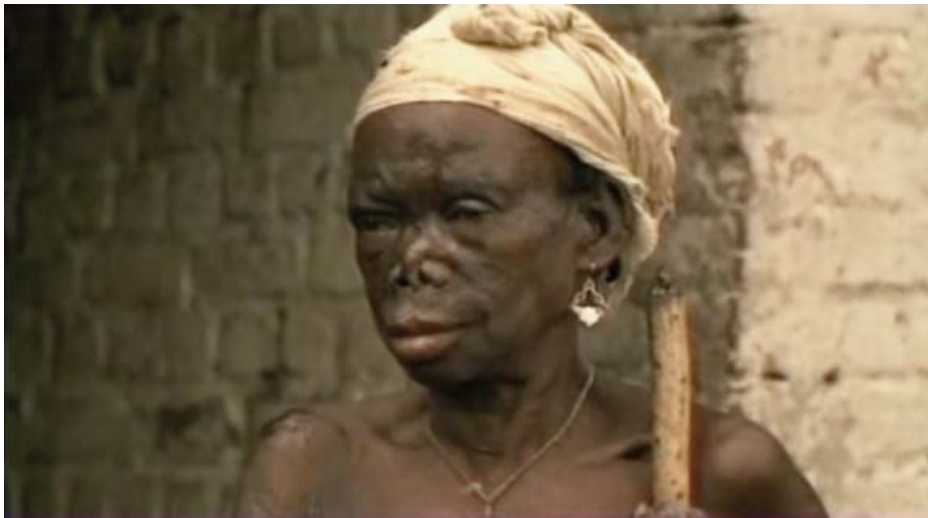
Erosion and collapse of the nasal septum.