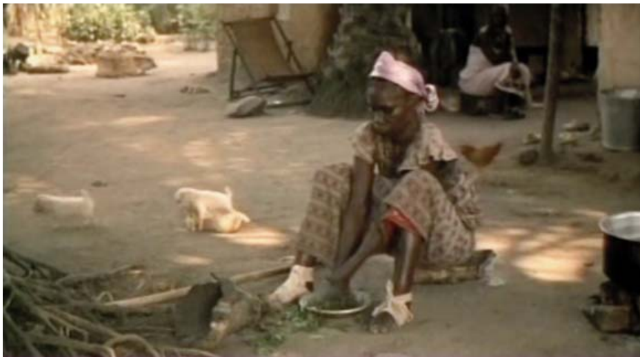
Loss of fingers and chronic foot ulcers.