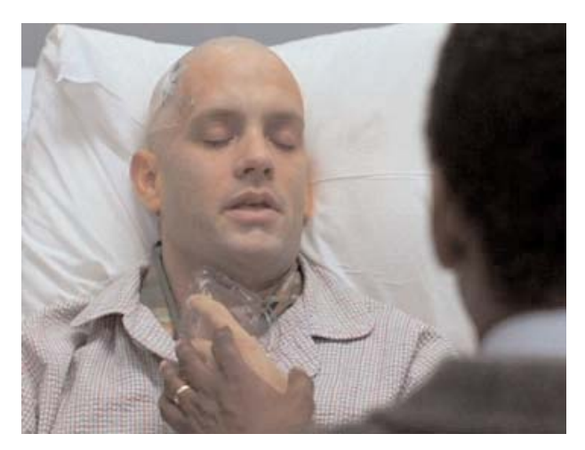
Figure 5: Andrew's last words

opera La Vestale by Gasparo Spontini) at the back reinforces the action, evoking the previous scene that we have already mentioned. (figure 5).