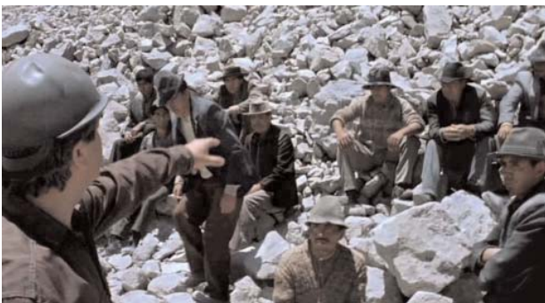
Figure 3: Miners from the mining town of Chuquicamata

From there, they travel to Peru, arriving at Machu Pichu, where the sight of its incredible architecture astonishes them. There is a boy in the place that shows them the old wonders of the Inca Empire. This is one of the scenes of the film that the director refers to like not glided, during this last passage of the trip, the main characters do not relate with actors but with people of the place that are simply caught in their simplicity, in a territory, where it seems that the time has stopped.