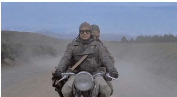
Figure 2: Alberto and Ernesto riding on the motorcycle La Poderosa