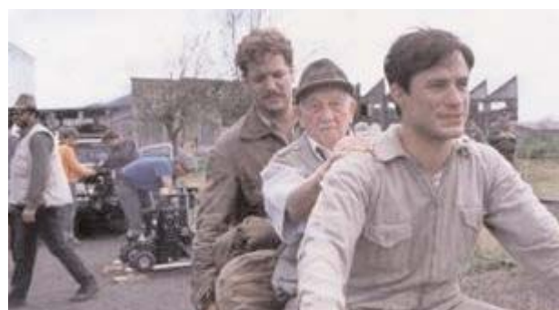
Figure 10: Gael García Bernal, Rodrigo de la Serna and Alberto Granados riding on motorcycle

Ernesto will return to Buenos Aires to take his last Medicine subjects. (figure 11) Four years later,