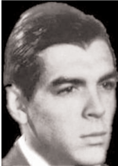
Figure 11: Ernesto Guevara in his younger days

he will go to Mexico and there he will meet with the Cuban opponents and six years later he will already have transformed itself into the “Commander Che Guevara”. He will die in Bolivian’s puna in 1967.