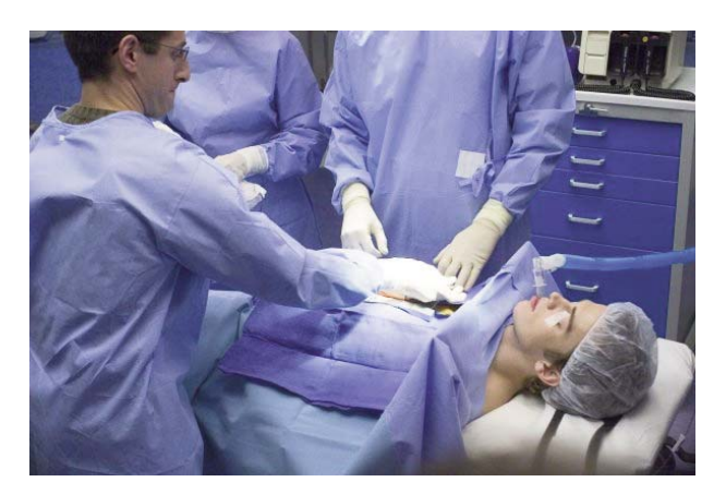
Figure 8: The operation and its atmosphere

21,000,000 patients are subjected to general anaesthesia. Most sleep calmly and remember nothing. However, 30,000 are not so lucky. They are not anaesthetized sufficiently and remain in a state known as intra-operative awareness. These people are completely paralyzed. They cannot even shout for help. They are conscious.