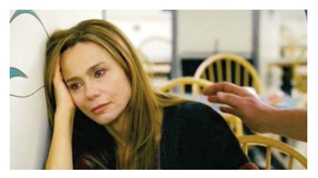
Figure 6: Lilith, Clay's mother , in the hospital waiting room

Dr. Neyer, called in by the dying mother, resolves the transplant problem with a new team of surgeons, while the police apprehend the villains. After a brief regression to infancy and the perception that "he will always be better than his father", Clay decides to return to this world, in which the new transplant is successful.