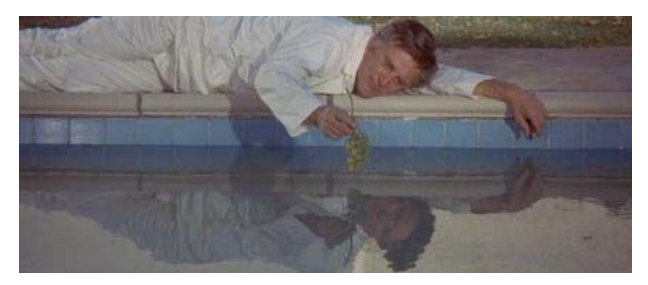
Figure 6: Reflecting

One way of standardising and assessing the degree of psychosocial stress is by using the "Holmes and Rahe Social Readjustment Rating Scale "6, where the levels of stress to which an individual has been subjected to in the last 12 months are calculated. If the score is above 250 points it is advisable to take action. In the case of Eddie, the score according to the Holmes and Rahe scale is 327 (separation or divorce + loss of job + his father's illness + an abrupt change in family finances + a change in the type of job activity + a relationship with Gwen + a traffic accident + a change in personal habits), which is clearly above the 250-point limit established for the disorder (Table 2)7.