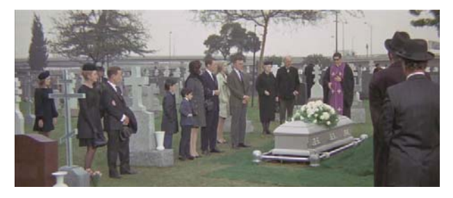
Figure 5.- In the last scene all the characters are gathered at the burial of Eddie's father

Eddie's symptoms are framed within adapta-