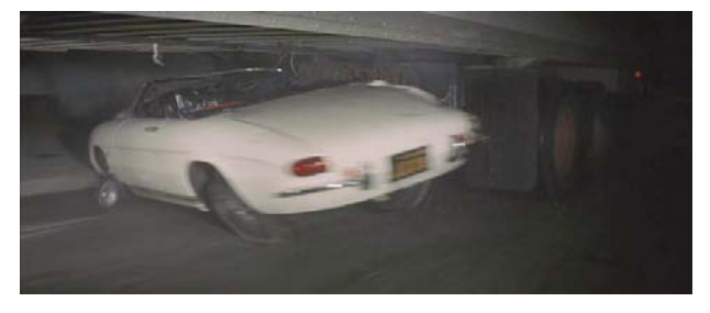
Figure 2: The main character tries to commit suicide by crashing into a lorry