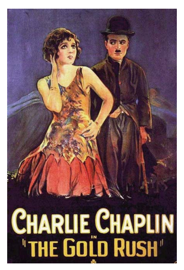
Figure 5.- A good film for smiling

The Gold Rush (1925) and The Great Dictator (1940) by Charles Chaplin, and It's a Mad Mad Mad Mad World (1963) by Stanley Kramer (Figure 5).