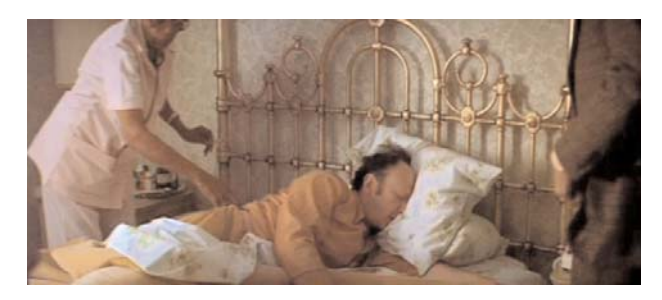
Figure 12: The flu cannot be treated with antibiotics

Joseph Sargent depicts the Mayor's flu' in four different film sequences. The first scene shows the Mayor receiving the news of the hijacked subway train; in this scene he is bedridden and under the care of a nurse who gives him some sort of medicine orally. He has a dry cough. In the next scene, where he talks to the Deputy Mayor, he has a runny nose, or rhinorrhea; he blows his nose into a tissue