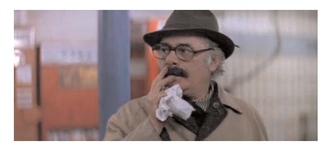
Figure 11: Mr. Green reattaches his moustache after sneezing

Joseph Sargent depicts the Mayor's flu' in four different film sequences. The first scene shows the Mayor receiving the news of the hijacked subway train; in this scene he is bedridden and under the care of a nurse who gives him some sort of medicine orally. He has a dry cough. In the next scene, where he talks to the Deputy Mayor, he has a runny nose, or rhinorrhea; he blows his nose into a tissue