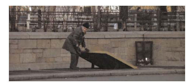
Figure 3: Mr. Green leaving the subway

The hijackers leave their hats, glasses and moustaches in a plastic bag, they remove their reversible overcoats and put them on the opposite way, and they put on new hats. In the process of getting rid of all incriminating evidence, they must leave their machine guns as well, but Mr. Grey refuses and Mr. Blue shoots him. Meanwhile the police officer shoots Mr. Brown, leaving only two of the four hijackers. Mr. Blue instructs Mr. Green to leave, saying well meet where we planned, right? Mr. Green escapes from one of the emergency exits (figure 3), while the plainclothes police officer and Mr. Blue engage in a shootout in which the police officer is injured.