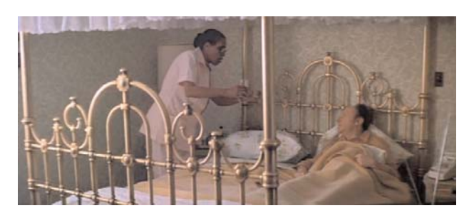
Figure 8: The Mayor of New York suffering from flu

The hostages : There are 17 passengers and a conductor on the train, among them a mother and her two children, a plainclothes police officer, a prostitute and a drunken woman. The make-up of the group of passengers in the tight confines of the subway train is quite diverse.