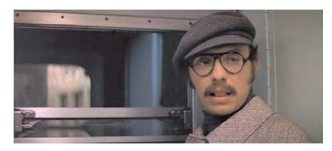
Figure 5: Mr. Grey

Mr. Brown : He is the third hijacker to appear when we see him boarding the subway at Grand Central Station. He is a relatively minor character, described by Mr. Grey as submissive.