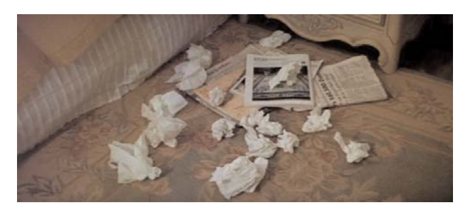
Figure 9: One of the things you should not do if you want to prevent the spread of flu'

Antiviral pharmaceuticals can also be used to prevent the flu, but they are not as effective as vaccination and they should only be used in certain cases<sup>3</sup>.