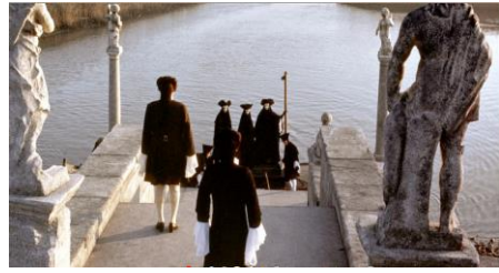
5. Don Giovanni , Joseph Losey (1979)

With regard to the set design, we can also highlight the intelligence with which both versions manage the depth of field. It is more evident in the 1979 version, where the layout of the narrative planes establishes a hierarchy of actions in the scenes which are arranged around the vanishing point of the entire picture, which in most cases is very far away. In both films, depth of field is achieved through the use of panoramic locations (the industrial unit which reproduces the artist's workshop in Juan , or the Palladio buildings of Venice and Veneto in Losey's version). The effect of spatial extension is also promoted by the tracking movements of the camera, which are created to maximize the three-dimensional quality of the scenic space that is shown.