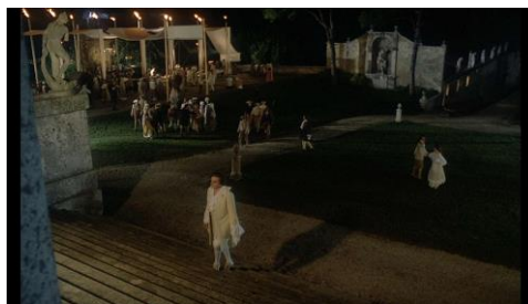
2. Don Giovanni , Joseph Losey (1979)

As we can see in figures 1 and 2, the audiovisual approach used in 1979 in Joseph Losey's Don Giovanni uses a classical language which is typical of historical cinema, in which the context of the narration gains special relevance (Gardner, 2004). Unlike Holten, Losey decided to narrate the scene with wide general shots that act as a spatial reference and which, in classical audiovisual language, have generally been accompanied by music with high harmonic density, a plurality of textures or an accelerated rhythm, as in the case of the finale of act I (Nieto, 2010; Citron, 2005, pp 204- 206). Based on that wide and grandiloquent approach and in line with the scenic design and the selected locations (the Italian buildings by Palladio in Venice and Veneto) the author uses group shots and mid shots to get gradually closer to the dramatic action (Gardner, 2004).