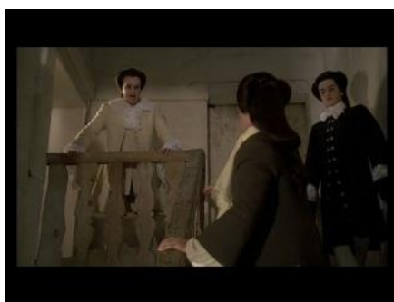
Don Giovanni , Joseph Losey. Finale act I

Figure 3: Low angle in Don Giovanni after the main character is discovered by the guests.